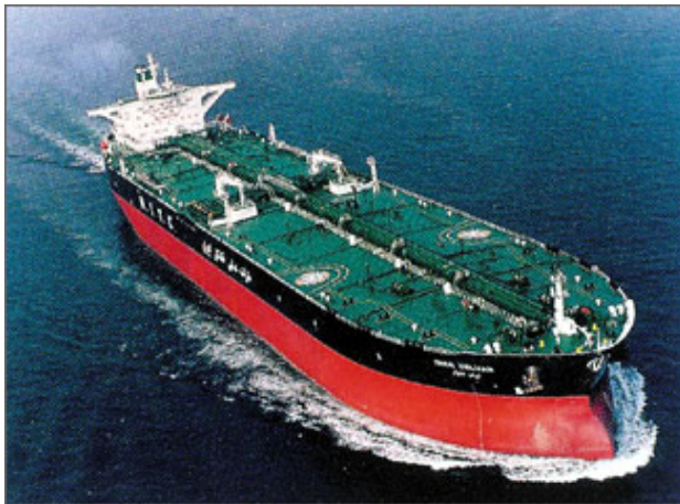
China-built oil tanker for Iran

“Iran’s growth of power in the region and the international arena is to Beijing’s interest,” he stated.