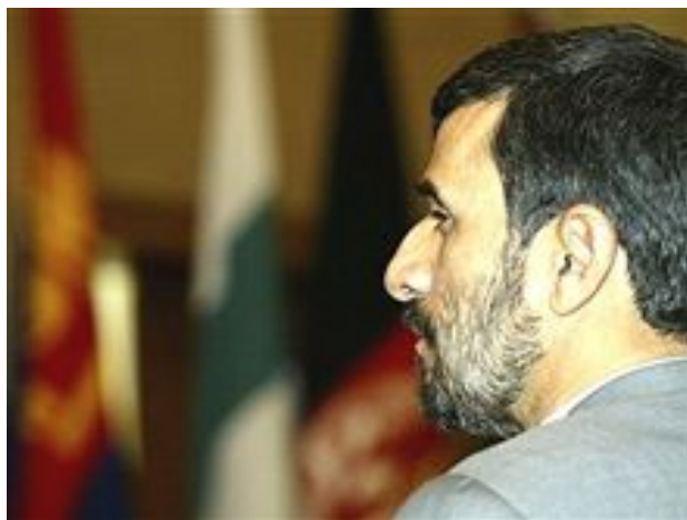
Pres. Mahmud Ahmadinejad of Iran at SCO meeting, July 2007

On March 24, Iran's official media reported that Iran will apply for full membership in the Shanghai Cooperation Organization (SCO), a would-be nascent EU-esque community headed by China and Russia and containing a fistful of continental Asian states.