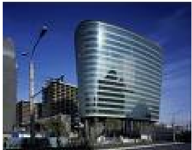
CNOOC in Beijing

While BP, Royal Dutch Shell, Total, and GDF are holding back, China and others are pushing forward. The China National Offshore Oil Corporation (CNOOC) reportedly concluded a deal for a $16 billion investment in Iran's North Pars natural gas field in December—in the midst of negotiations on the third round of UN sanctions.