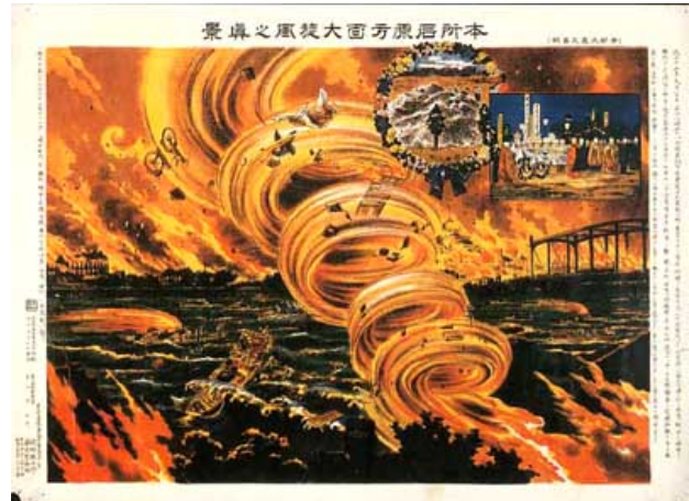
Sketch of a giant whirlwind toward Hongo-Ishihara