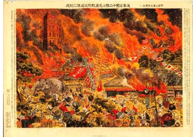
Fire spreading to the twelve-story tower in Asakusa Park and Hanayashiki Amusement Grounds, Tokyo

September 1, 1923, 11:58 a.m. The earthquake of magnitude 7.9 violently shook the Kanto region encompassing Tokyo, Kanagawa, Saitama, Chiba, and other prefectures. That day a total of 114 tremors were felt. In Tokyo alone, 187 major fires broke out, quickly wrapping the metropolis in flames, burning down homes, industrial facilities, and public infrastructure. The death toll reportedly exceeded 100,000. This was the Great Kanto Earthquake of 1923, the most dreaded memory of natural disaster of its kind in Japan to this date, far surpassing in its destructive power the January 1995 Great Hanshin-Awaji Earthquake that struck the Kobe region.