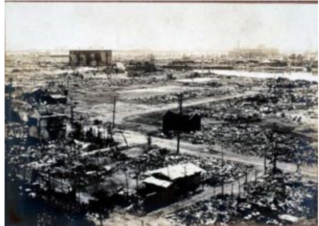
Earthquake destruction in Yokohama