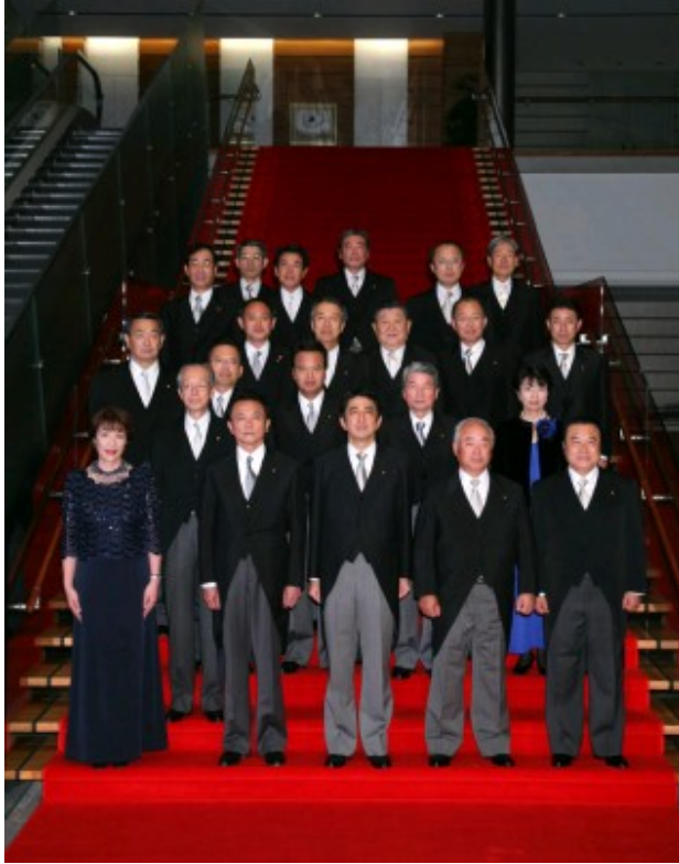
The new Abe cabinet

election, trust in the Abe administration, even on the part of the supposedly conservative local government, was at historically low ebb.