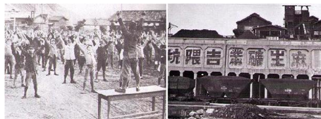
Left: Aso miners doing calisthenics during the war; right: ore cars at the Aso Yoshikuma mine. (The 100-Year History of Aso)

“In response to the enemy’s materiel offensive, we will fight by means of increased coal production,” said Kishi Nobusuke, then Japan’s minister of commerce and industry. “All miners must come together in spirit and the patriotic mining industry must dash forward.”