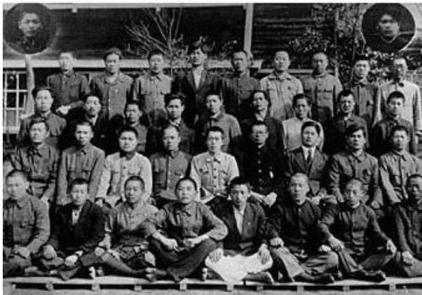
Young Korean labor conscripts at Aso Mining's Atago mine: workers assigned to the Jowa dormitory in 1942 (top) and the Yamato dormitory in 1943.

There were also 300 Allied POWs at the Aso Yoshikuma mine in Fukuoka Prefecture. Documentation includes the Aso Company Report of January 1946 and other records produced by the postwar Japanese government, as described by Japan Focus in May 2007.