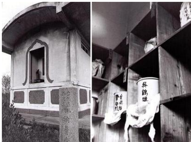
1975 images of the exterior and interior of the Aso Yoshikuma charnel house. Six containers of Korean ashes (right) disappeared the following year.

By 1976, however, all six sets of Korean remains had been removed from the charnel house shelves. Hayashi was shown a small hole beneath the shelves and told by the Buddhist priest in charge that the Korean remains had been deposited in an underground storage area. The unusual funerary practice was not further explained.