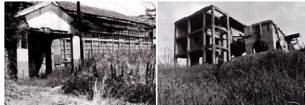
The abandoned Aso Yoshikuma work office (left) and ruined Yoshikuma mine buildings in the late 1970s.