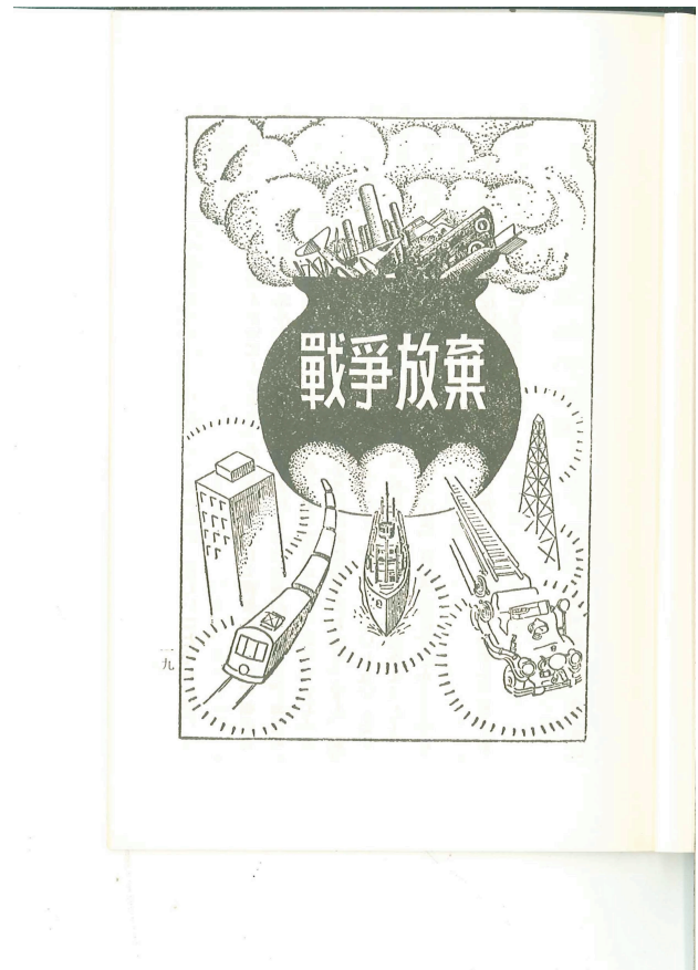
From tanks and bombs to trains and buildings

It is an outcome that is not captured by discussion of the origins of the Article (e.g., as