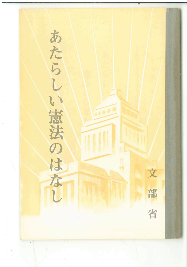
Story of the New Constitution cover

trade-off for keeping the emperor, stated in Article 1), much less by the unimaginative arguments about the need to become a "normal," i.e., armed nation. Nakajima's still palpable pleasure in the illustration of tanks and bombers going into a cauldron and trains and fire engines and buildings coming out the bottom in "The Story of Our New Constitution," the supplemental social studies textbook issued by the Ministry of Education in 1947, sixty years after she encountered it in junior high school, is but one indication of the enthusiasm for peace unleashed by war's end and given shape by the Constitution.