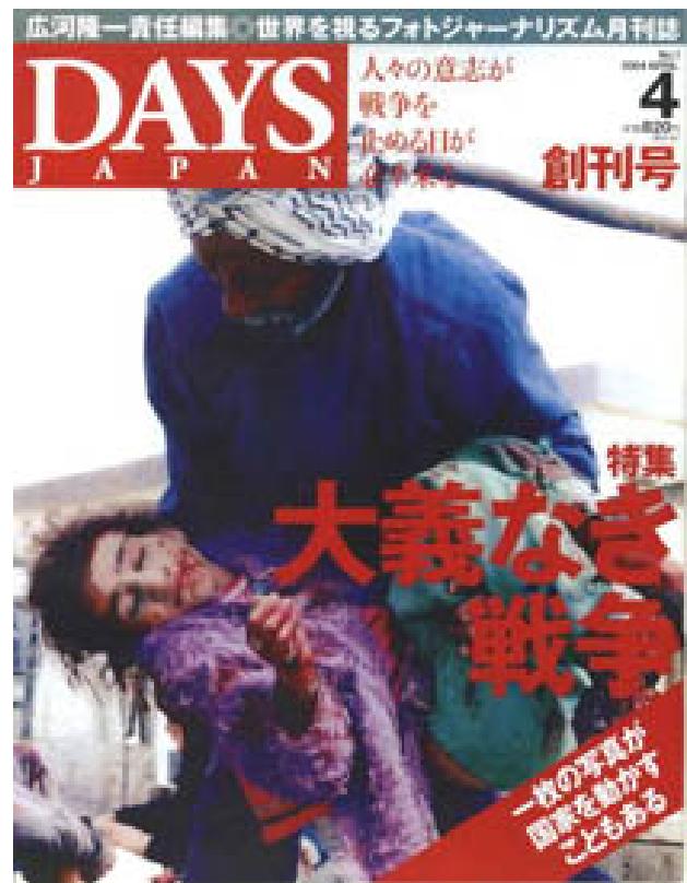
The cover of DAYS Japan , inaugural issue (April 4, 2004).

of pain and sadness coming from the Iraqi people, and the footsteps of war that are approaching Japan? The plaintiffs and the attorney before you can hear them clearly. We have brought this lawsuit with the urgent desire of stopping this development. It is truly a shame that the court has not admitted the testimony of witnesses and Plaintiffs, but the Plaintiffs have submitted extensive documentary evidence. We ask that the court read all the documentary evidence and take the time to confront, in silence, this photograph of a bloodstained girl. And please do not hand down a decision along the lines of the Kofu District Court decision, as argued by the State. That self-abnegating decision might as well be deemed a suicidal act on the part of the Court.