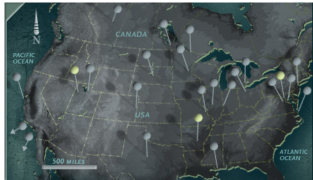
US bioweapons map, early 1950s.

recent years in the tale of possible American use of biological agents in the Korean War.[28] But the American appetite for such investigations is so low that the publishers of a celebrated British study of Unit 731 saw fit to excise the Korean War chapter highlighting U.S. collaboration with Japanese BW experts in Korea in the American edition of their work.[29]