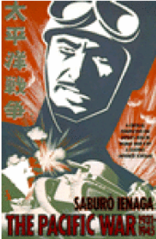
Ienaga Saburo's The pacific War.

A study of the postwar politics of revelation of Japanese wartime medical experiments does not engage the issues of the causes of those initiatives and cannot predict the degree to which we might see questionable medical practices surfacing again in Japan's future. But by shifting the focus from the purported "culture" to the politics of Japanese "forgetfulness" after 1945, it does suggest that an important indicator of future developments may be found less in certain Japanese cultural practices (as is often stressed in the literature on Japanese bioethics),[73] than in the political lay of the land. The politics of exposure of wartime Japanese BW experimentation remains as vital as ever and continues to enrich Japanese public consciousness regarding this dark chapter of national history. Likewise, critical issues of bioethics (brain death, stem