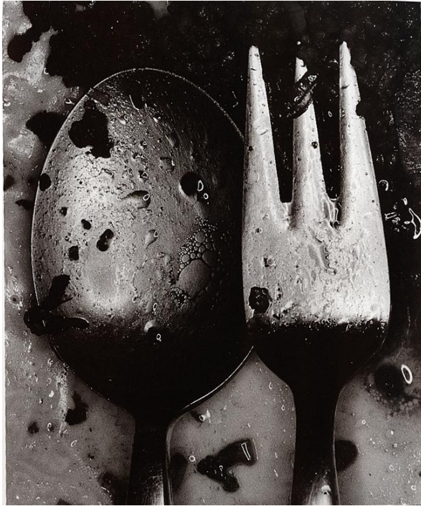
From the collection at the Barbican in London

He has photographed other places, and even men, but it is Tokyo's women he keeps coming back to, ever since picking up a camera in the sixties. "For me, taking photos is essentially an act of love," he says. "I know when I look into the viewfinder and can't sense the sexiness that it is going to be a bad photograph." All creativity, he believes, comes from the sexual urge; he often compares the timing of depressing the shutter to sex. "I don't take photographs with my head. I take them with my dick."