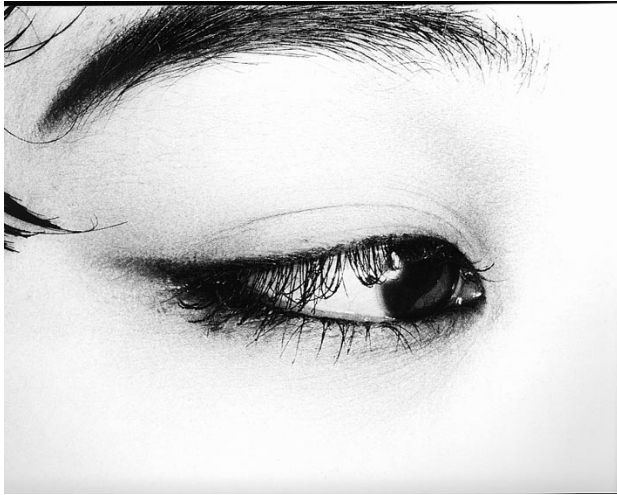
From the collection at the Barbican in London