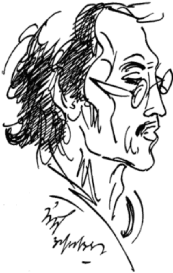
Sketch of Noguchi

Uttarayan Santiniketan, Bengal September 1, 1938