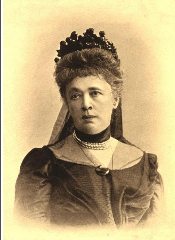
Bertha von Suttner (1843-1914), Austrian peace campaigner and novelist, the first woman to win the Nobel Peace Prize

We must understand that two philosophies, two eras of civilization, are wrestling with one another and that a vigorous new spirit is supplanting the blatant and threatening old. No longer weak and formless, this promising new life is already widely established and determined to survive. Quite apart from the peace movement, which is a symptom rather than a cause of actual change, there is taking place in the world a process of internationalization and unification. Factors contributing to the development of this process are technical inventions, improved communications, economic interdependence, and closer international relations. The instinct of self-preservation in human society, acting almost subconsciously, as do all drives in the human mind, is rebelling against the constantly refined methods of annihilation and against the destruction of humanity.