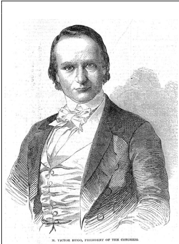
Victor Hugo addresses the Paris Peace Conference, Illustrated London News , 1 September 1849

apostles of truth, let us invoke the illustrious shadows of those who, faced by monarchs who dreamt of war, proclaimed the human right to life, the right of conscience and freedom, the supremacy of reason, the sanctity of work, and the blessings of peace. And, since the thrones of our monarchs cast us into darkness, let the tombs of these great thinkers restore us to the light!