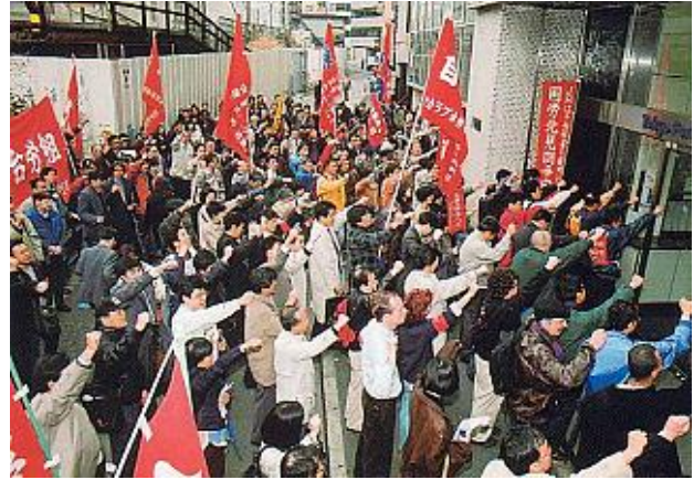
National Union of General Workers, Tokyo