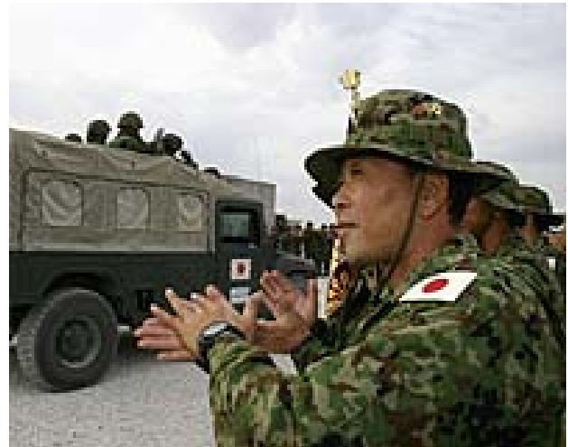
GSDF Troops in Iraq

On July 19, 2006, the final elements of the Ground Self-Defense Forces (GSDF) mission rolled across the border between Iraq and Kuwait. The 2 1/2 year mission in Samawa ended without the deaths of any GSDF member on Iraqi soil -- although it was indirectly related to the deaths of several Japanese civilians. As this watershed event was taking place, the future policies of the Japanese government remained shrouded in uncertainty. Was this the effective end of Japanese support to the post-Saddam Iraqi government? Or was it simply the beginning of a new phase?