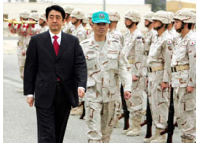
Former Prime Minister Abe Shinzo reviews ASDF troops in 2007

Significant Japanese newspaper reports on the ASDF mission did not begin appearing until April 2006 when the Asahi Shinbun ran a five-part series that had clearly gained official cooperation. A year later, then-Prime Minister Abe Shinzo allowed himself to be photographed inspecting the troops during his April-May 2007 tour of the Persian Gulf.