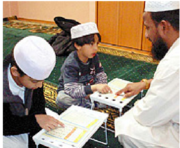
Children learn Arabic at the Yokohama Mosque

At the mosque in Ebina, Kanagawa Prefecture, about 10 children around age 10 are learning the Arabic alphabet. Every day from 4 pm to 8 pm, the mosque holds Koran classes. They started last November, at the urging of Pakistani and Bangladeshi Muslims living in the area who wanted their children to be properly versed in the ancestral religion and the Arabic language. The classes are taught by the parents themselves.