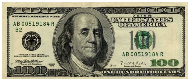
US 100 dollar supernote