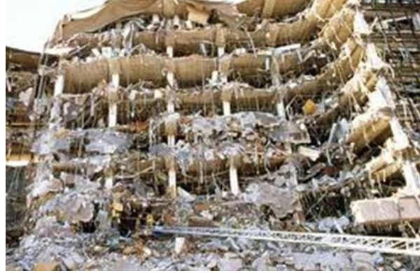
On April 19, 1995, the Alfred P. Murrah Federal Building was bombed, killing 168 and injuring 800.

But the most striking parallel between these two cases of terrorism is the incalculable harm done to innocent victims. These were attempts to kill randomly and on a grand scale, and in an awful way they succeeded.