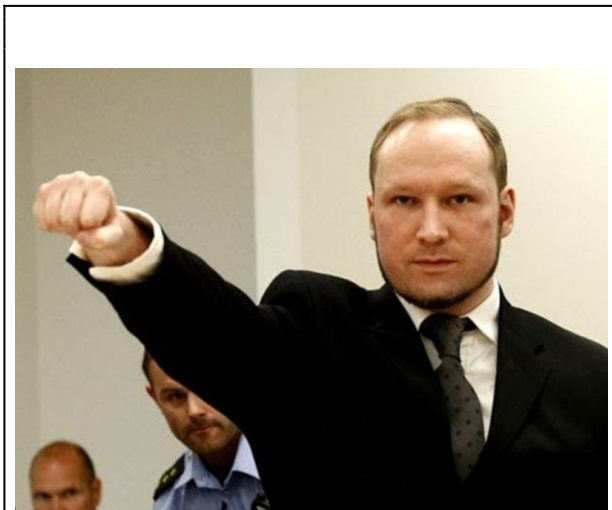
Breivik in Oslo courtroom after sentencing.

continue to make Japan’s public anxious and angry. Those public responses may seem inevitable, but they are as much a product of the media penchant for peddling fear and fury—and of political leaders’ priorities—as they are “natural” human reactions. As Mori Tatsuya recently reported, reality is constructed quite differently in Norway, where Anders Behring Breivik killed 77 people in July 2011 before being sentenced to 21 years in prison in August 2012. 34