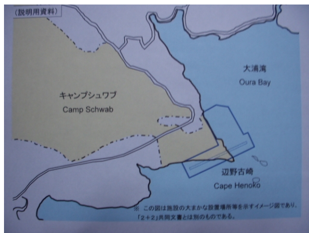
Plan for the Henoko base

current one) were defeated by a coalition of local and national environmental and anti-base groups, which camped around the clock at the site and surrounded and blocked the survey workers in canoes and small craft. In September 2005, Prime Minister Koizumi withdrew the plan. The new site was chosen in part because it would allow construction to be done from within an existing US base, Camp Schwab, a few hundred meters away from the one that Koizumi had abandoned. It consisted of a much expanded, dual runway, v-shaped structure that would span Cape Henoko and extend into the sea at both ends. Centering it on the base would make the site virtually inaccessible to protesters.