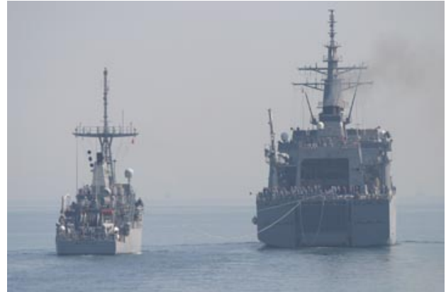
The MSDF Bungo in 2004 in the Persian Gulf prepares to refuel the USS Patriot (right)

On 11 May 2007, the Japanese Maritime Self-Defense Force's Bungo minesweeper set sail from the naval port of Yokosuka for Okinawa, under orders from Prime Minister Abe to assist in a "preliminary" survey of the ocean floor of Oura Bay, where his government plans to construct a state-of-the-art base for the American marines. Under cover of darkness, divers from the Bungo carried out their seabed survey and the ship then withdrew. The operation took only a few days, and neither the media nor the local and national groups opposing the base caught sight of the Bungo or its divers.