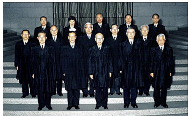
Justices of the Supreme Court of Japan, those with the constitutional authority to interpret the Constitution

judicial review generally was limited to ex post facto consideration of concrete cases, in the American tradition, as opposed to permitting requests, either by private litigants or the government, for determination of hypothetical questions on the constitutionality of prospective events.[14] Thus, the government cannot refer the question of whether, for example, a government policy permitting the deployment of Maritime Self Defense Force (MSDF) ships in defense of US vessels in international waters would violate Article 9, as would be possible in Germany or Canada, to name just a couple of constitutional democracies with a system that permits constitutional references.