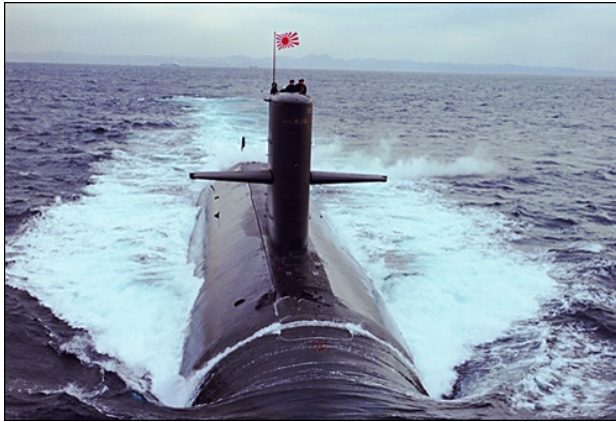
The Takeshio, one of Japan's 3 Yushio class of submarines, and part of a fleet of 16 submarines

Russia views the deployment of similar BMD systems in Eastern Europe. It is often argued that BMD systems are not purely defensive, as they increase the vulnerability of those states whose deterrence power is thereby undermined.