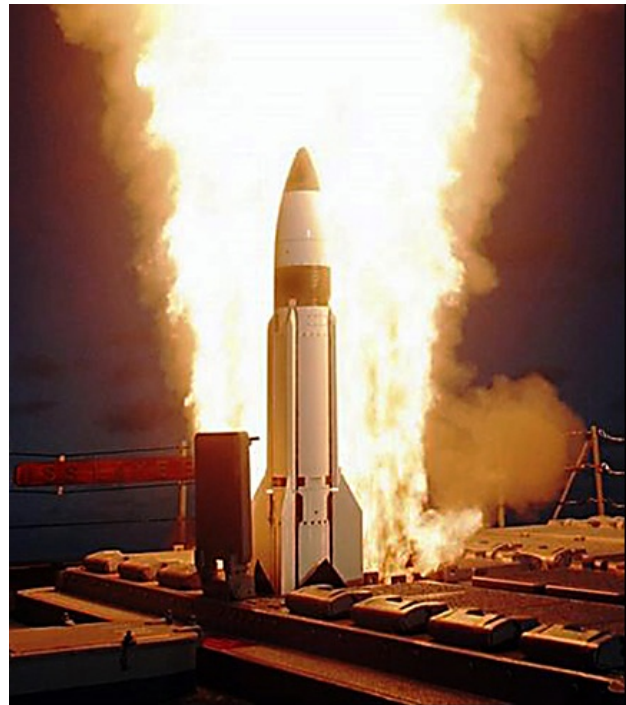
The ship-based launching of an SM-3 Missile, similar to those to be deployed as part of a joint US-Japanese BMD system

defense of the United States.[12] The “re-interpretation” being sought is in part designed to legitimize a BMD system already agreed upon and currently under development.