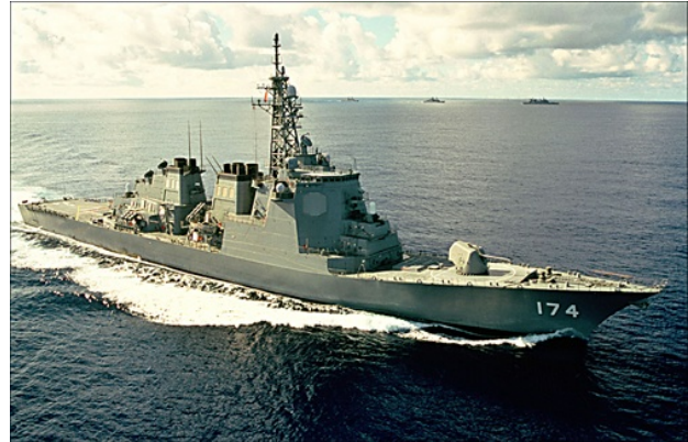
The Kirishima, one of Japan's 4 Kongo Class Aegis guided-missile-system destroyers, and part of a fleet of 44 destroyers

This interpretation leads, of course, to all kinds of tortured arguments over what constitutes defensive weapons as opposed to offensive weapons, what exactly “war potential” means, and when defensive weapons systems might cross the line to become war potential.[21] But putting aside questions of whether, for instance, Japan’s Kongo Class Aegis guided-missile-system destroyers and its fleet of 16 submarines constitute offensive weapons, this is and has long been the accepted interpretation in Japan. It was departed from with the passage of legislation in 1992 to permit support activities in UN peace keeping missions, and to deploy support forces for the Afghanistan and Iraq campaigns, but the prohibition against collective self-defense remains the prevailing understanding of Article 9.[22] Thus, while Japanese SDF troops were deployed to Iraq under special legislation for “support” purposes, the troops were classified as “non-combat” and operated under strict self-defense rules of engagement, to the point that they were under the “protection” of the Australian forces.[23]