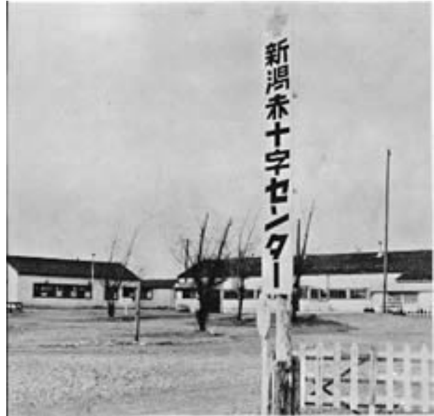
Japan Red Cross Center in Niigata

Meanwhile, the limited welfare payments available to Koreans in Japan were being drastically slashed - a measure that must surely have made the prospect of life in communist North Korea look more appealing. At the same time, the Japanese Red Cross was engaged in a secret search for ships to carry out the project.