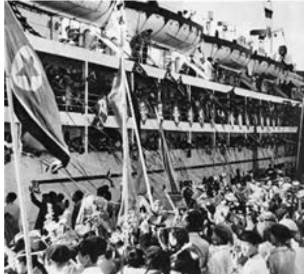
North Koreans at Cheongjin welcome the repatriates

Testimony from the small number of former “returnees” who have recently slipped across the border out of North Korea recalls the shock they felt on first arriving and realising the desperate poverty of the country to which they had come. Their plight was made worse some years after the start of the “repatriation”, when the North Korean government began to regard “returnees” from Japan with growing suspicion and prejudice. Thousands were sent to labour camps. Of these, many were never heard from again.