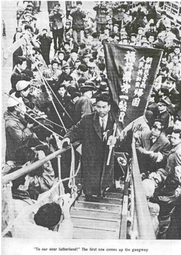
The first to board the ship for North Korea

The International Red Cross “confirmation of free will”, which was set in place to guarantee to the world that this was a voluntary migration, proved (despite the best intentions of some of those involved) to be little more than a public ritual, too poorly-staffed, lacking the necessary information, and carried out too late in the day to have its intended effect.