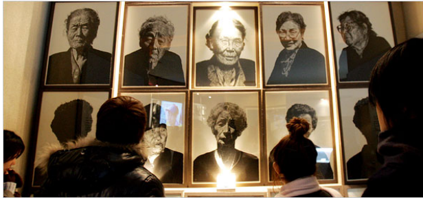
Japanese student in Seoul view exhibit showing photographs of former 'comfort women'

involvement of the Japanese military in the creation and maintenance of the system. Further official documentation unearthed by Yoshimi Yoshiaki also confirms this fact. [8]