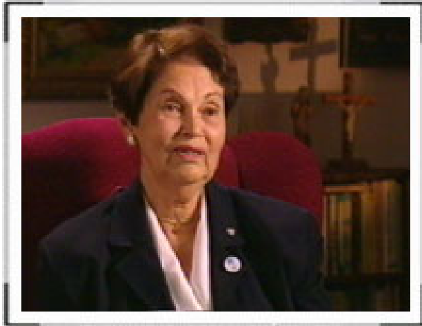
Jan Ruff O'Herne