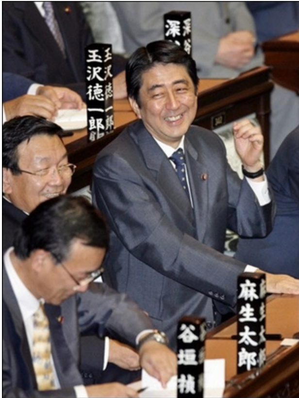
Prime Minister Abe at the Diet

commenting that there was "no evidence" that the recruitment of "comfort women" had been "forcible in the narrow sense of the word". Speaking during a Diet committee debate a few days later, he reiterated this statement, clarifying the fact that, to be "forcible in the narrow sense of the word" the system would have had to involve "officials forcing their way into houses like kidnappers and taking people away". [3] Abe, however, clearly has no problem with the proposition that the recruitment of "comfort women" was forcible "in the broad sense of the word", and feels no historical responsibility for this, since he has made it clear that he and his government will not apologise whatever the outcome of the US Congressional resolution. [4] His Foreign Minister Aso Taro, has also attacked the US resolution, saying that it is "not based on the facts". [5]