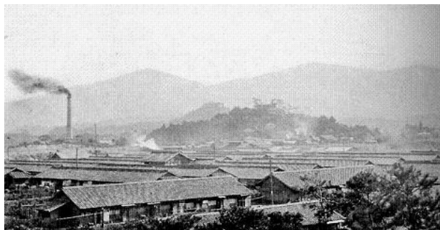
Undated photo of Aso Yoshikuma coal mine, Fukuoka