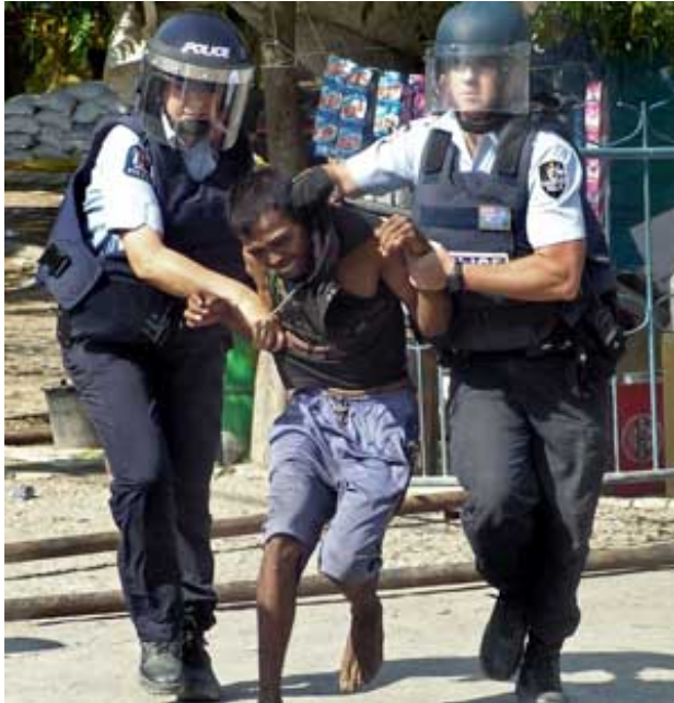
A youth is detained by Australian police in East Timor, 2006.

This officer says the gang violence has reached a new stage that it shows signs of coordination. Whereas previously gang attacks seemed random, they are now being choreographed. He noted an evening when three melees broke out simultaneously in different areas in Dili in a move that seemed designed to test the responses and capabilities of the over-stretched security forces.