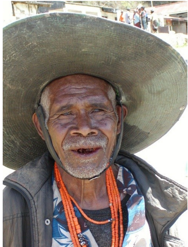
An East Timor elder, teeth darkened by betel

Luiz Viera of the International Organization of Migration (IOM) told me that the government did not want to build alternative IDP sites because it feared sending the wrong message. The camps have become a tangible symbol of the government's failure to protect the public, and its inability to ease fears that violence will erupt again. Building new camps could be seen as a sign that the government was resigned to this situation.