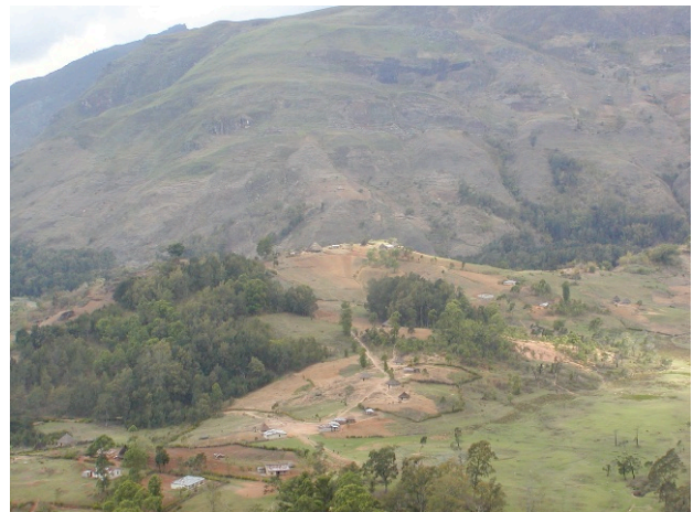
Landscape of drought-stricken Maubisse, East Timor

Anxiety also fed on the ominous omen of the birth of a one-eyed pig with an elephant-like snout. Then, when a lake outside Dili suddenly turned blood red, many saw it as a harbinger of violence in 2007.