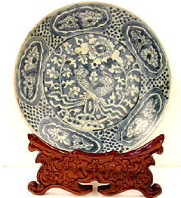
Early Ming plate found on shipwreck near Ternate, Moluccas, eastern Indonesia

longer to establish there. We can put together a rough chronology of the establishment of these trade routes, by analysing certain texts, initially mainly Arabic and Chinese ones, but also in particular by using the data of Chinese ceramic exports, which can be found on all the shores and which have been well studied in recent decades.