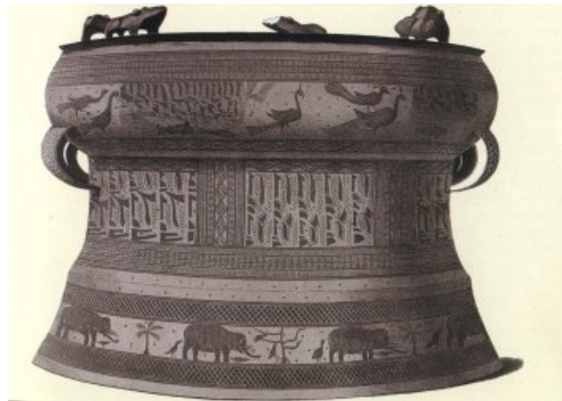
Dongson drum probably made in Vietnam circa 200 A.D.

the West and the Han in China), the discovery of an impressive number of bronze drums provides us with the outline of what is called Dongson culture, reaching west from the bronze rich southwest of China to the borders of Iran, and to the south passing through Vietnam, Malaysia, Sumatra, Java, Bali, Sumbawa, etc. That other technical information, like the use of braced ridge tiles, [7] could also have spread along with bronze working cannot be doubted. Some pre-historians are currently researching the presence of boat-coffins, found equally in Wuyishan, one of the highest places in northern Fujian, in the Niah cave (northern Borneo), and in several places in the Philippines.[8] Generations of students of mythology have also studied the similarities found among the various folklores of river-valley dwellers.