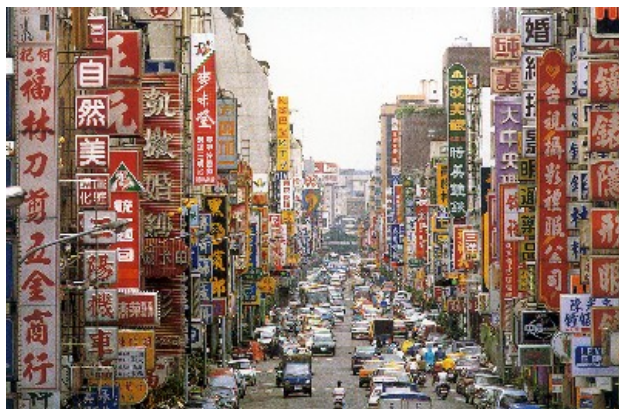
Postcard image of Taiwan

As for the two large islands of Hainan and Taiwan, which are like anchors cast out to sea from the Chinese continent, it is quite fascinating to compare their evolution. Both were initially occupied by non-Chinese populations, in the first case by Thais especially and by Austronesians in the second, so we could say that, from a certain perspective, they were both at base “Southeast Asian”. But if Hainan was Sinicised quite early and has never ceased to form part of the continental system, Taiwan was not really occupied before the seventeenth century, above all by farmers from Fujian; and we know what its recent evolution has been.