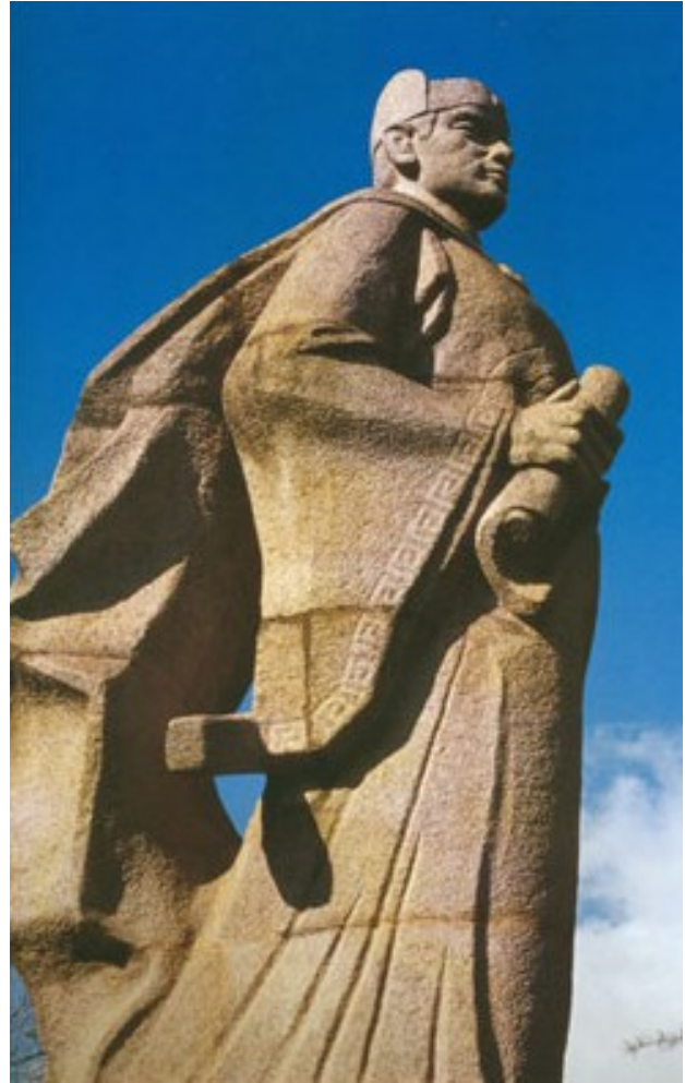
Statue of Chinese admiral Zheng He (1405-1433)

From this point on, we could say that the circle was closed and that henceforth the Nanyang operated as a Southeast Asia “Mediterranean”. From the thirteenth to the sixteenth centuries, we witness the remarkable development of south Fujian’s large ports: Zhangzhou and Quanzhou, then Amoy (or Xiamen). In the last two cases, a wealth of Muslim inscriptions attests to the presence of a large foreign community, comprising Arabs and Persians. Powerful Hokkien merchants now began setting up bases not only in Java, Patani, and the Philippines, but also in Guangdong and Hainan. In parallel, at the same time, a whole series of independent merchants, Japanese and Chinese (whom we call the wokou ), took advantage of the favourable circumstances to develop a private commerce not only between ports in China and Japan but also in Southeast Asia, where no state watched over them.