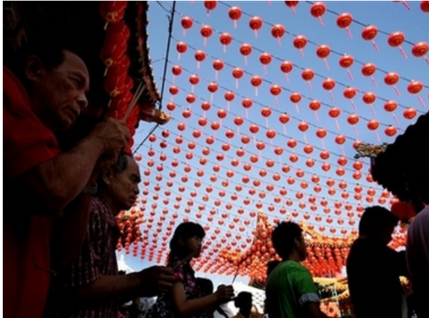
Ethnic Chinese offer prayers at a temple in Kuala Lumpur, February 2007

It is worth noting that such a spatial, and above all mental, “uncoupling” of Southeast Asia from southern China serves the interests of a lot of people. First of all, it allows Western Southeast Asianists to exhibit, unblushing, a fine ignorance of China (no small advantage, when we consider the difficulties we know await the apprentice Sinologist...). It is also reassuring: by clearly isolating fields, it justifies ignorance in the name of a supposedly indissoluble and airtight compartmentalisation. The thing is also probably done to please many people from the countries involved, Indonesians, Malaysians, or even Vietnamese, who rarely like to think of their large neighbour, or to measure themselves against it, and would all prefer to create a collective dead-end in its respect (despite the dangers this might represent for their own futures). Let us add, too, that it is by no means certain that this approach would not also appeal to many responsible Chinese of the continent who, still concerned about the approach of “southern miasmas”, prefer to remain within the shelter of their borders in order to better imagine “the State”. ... Today only Japanese and Taiwanese businessmen have a clear awareness of the intellectual heresy that this fictive “wall” represents: Japanese and Taiwanese businessmen, and Chinese businessmen from