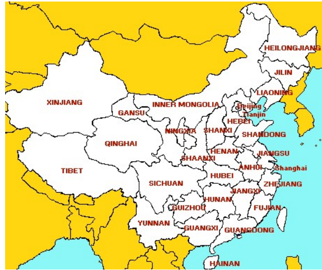
Map of administrative divisions in China

At this point, we can affirm that wanting to understand Southeast Asia without integrating a good deal of southern China into our thinking is like wanting to give an account of the Mediterranean world after removing Turkey, the Levant, Palestine, and Egypt. By this new "centring"—or rather, by restoring the centring—geography can and should help us to go beyond the received ideas that a certain style of history wants to us preserve, by insisting on staying too close to the facts (or to certain facts).