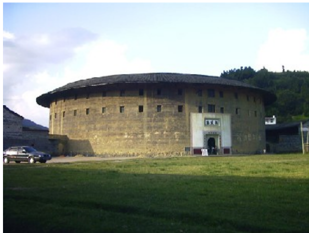
Hakka dwelling in southern Fujian

wonderful ability to preserve their original traditions (and dialect). But today the tendency is to view them as “aborigines”, as people of the South, who had been progressively but incompletely acculturated by Han civilisation. [9] And it is very true that certain of their customs (for example, double funerals) are better explained by the existence of an “old Southeast Asian stock” than by any import from the North. [10]