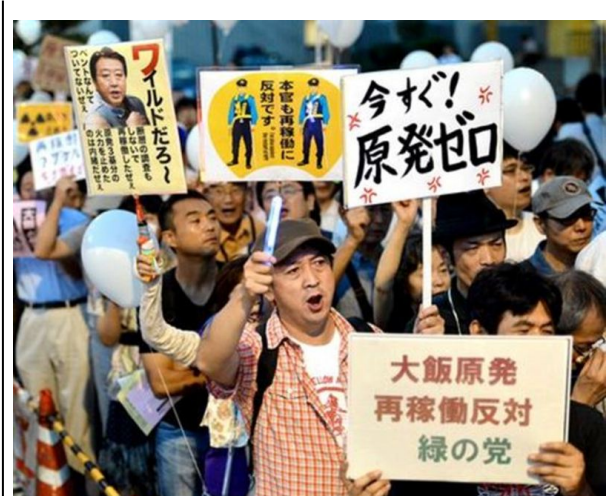
Anti-nuclear power activists in the weekly demonstration at the prime minister's office Sept. 14, calling for the abolition of nuclear power. "Nuclear Zero Right Now." (Satoru Ogawa)

Observers see the policy as a product of compromise, and something which Prime Minister Noda hopes will both get him re-elected in a party leadership race this month and win support from ordinary voters in the upcoming Lower House election. Noda himself is unwilling to dump nuclear power. It is instead what the public and many in his Democratic Party of Japan have increasingly been demanding.