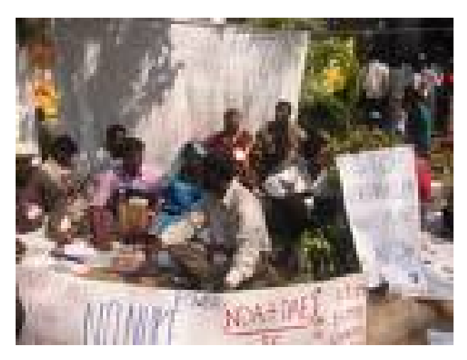
Anti-nuclear protest at World Social Forum, Mumbai, 2005

Many protested violations of the MoEFspecified norms, in particular, the absence of 30 days' notice, and wide publicity for the EIA summary translated into the local language (Tamil).