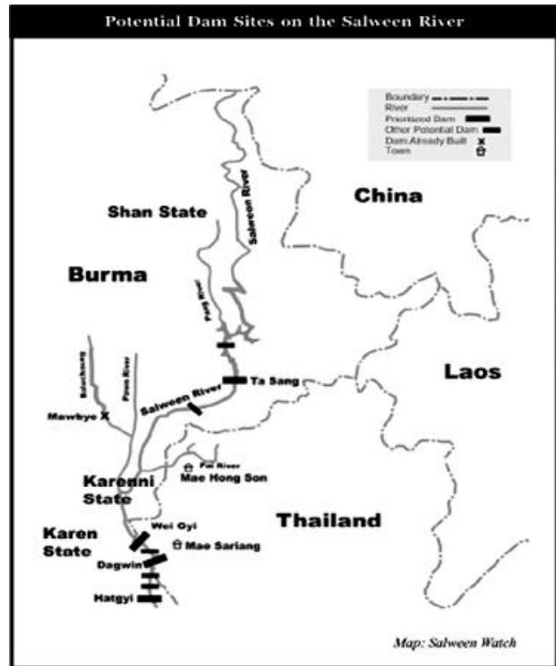
Map 2: Potential dam sites of the Salween River

Of great importance to any discussion of the Salween’s future as a prospective site for a series of dams is the rich biodiversity existing along its entire course. In addition there is a remarkably diverse set of minority ethnic population groups in the regions through which it flows, both in China and Burma. Indeed, the presence of ethnic minorities along the Salween in Burma has been the touchstone for the vigorous opposition to the plans for the construction of dams on the river from a varied range of advocacy NGOs, most particularly in Thailand. Both in Burma and in China there is concern among human rights advocates that dam building will lead to the displacement of populations. And this prospect, as discussed later, is seen by critics of the Burmese regime as yet another example of that government’s efforts to impose control over dissident minorities.