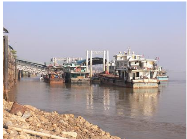
Photograph 2: Chinese vessels at Chiang Saen

there are plans to build a further facility downstream from Chiang Saen, which will be capable of servicing vessels up to 500 DWT. Although some of my informants spoke of work already being under way for this new port, with feasibility studies supposed to have been completed by 2006, I did not see any indication of this during my visit to Chiang Saen. (See Photograph 2 of Chinese vessels moored at the existing Chiang Saen facilities in January 2007.)