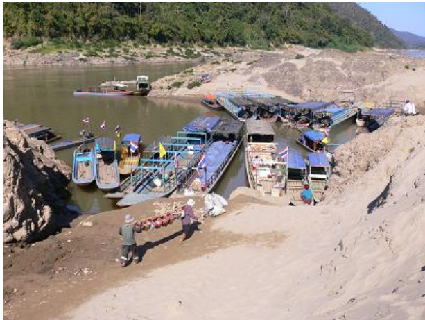
Photograph 1: Salween at Ban Sam Laep

(See Photograph 1 of the Salween taken at Ban Sam Laep, on the left [Thai] bank, where the river forms the boundary between Thailand and Burma.)