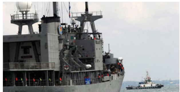
Indonesian navy patrol in the Malacca Straits

Southeast Asia is home to important sea-lanes and straits, including the Malacca Straits, one of the busiest waterways in the world. Each year more than 60,000 merchant vessels transit the straits, which connects the Indian Ocean with the South China Sea. Tankers carrying oil from the Middle East to countries such as China and Japan, which rely heavily on imported oil, are