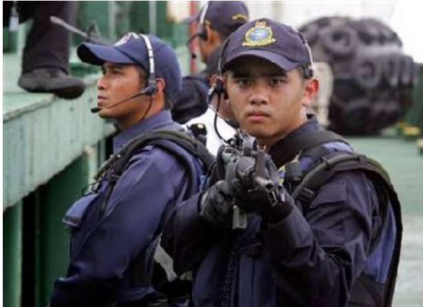
Members of the Singaporean navy in an anti-piracy exercise, Singapore Straits

Southeast Asia has since the late 1980s also become one of the global ‘hot spots’ of pirate attacks on commercial vessels and fishing boats. According to data from the International Maritime Bureau’s Piracy Reporting Centre, the number of actual and attempted pirate attacks reported worldwide from 1992 to 2006 ranged from 90 attacks in 1994 to as many as 469 reported incidents in 2000. [7] The data indicates that between 1992 and 2006, Southeast Asia was the most ‘pirate infested’ region in the world. From 1990 to 1992, the waters between the Malacca and Singapore Straits were identified as the most pirate-prone. But after the initiation of coordinated anti-piracy patrols in this area, the focus of piracy shifted to the South China Sea. Between 1993 and 1995 a high proportion of reported attacks took place in the South China Sea. Particularly affected were the territorial waters of Hong Kong and Macau and the so-called HLH ‘terror-triangle’, encompassing the waters between Hong Kong, Luzon in the Philippines and China’s Hainan island. [8] While the number of attacks began to decline in this area by the mid 1990s, China once again became the focus of international concern when in the late 1990s growing numbers of hijacked vessels were found in Chinese ports. However, since the mid-1990s, as Soeharto’s New Order regime unravelled, Indonesian ports and territorial waters have