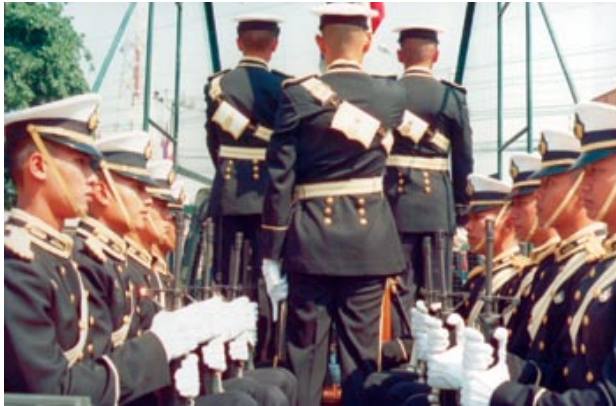
Honor guard, Thai navy

Bateman pointed out in 1996, the Southeast Asian countries remained only medium maritime powers despite the modernisation programs. Even in comparison to the naval forces of neighbouring countries, such as Japan and China, the naval capabilities of Southeast Asian forces remained moderate. [18]