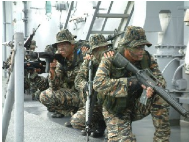
Philippine navy and coast guard personnel with U.S. military personnel in a joint exercise

[...]. How do you expect government to tightly watch its territorial waters when we lack the necessary equipment and vessels to patrol our borders with Indonesia. [30]