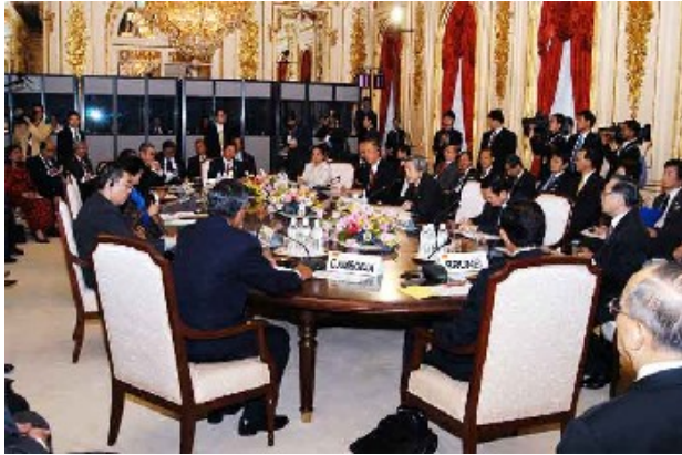
ASEAN leaders meet in Japan in 2003

have, however, been limited by its policy of non-interference in domestic affairs. [46]