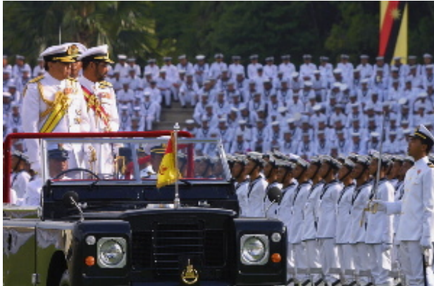
Honor guard inspection, Royal Malaysian Navy

invested heavily in its naval forces, including the coast guard, and the limited size of the country's national waters makes them easier to secure than those of neighbouring countries. Consequently, Singapore waters enjoy the reputation of being safe, and very few criminal incidents are reported there.