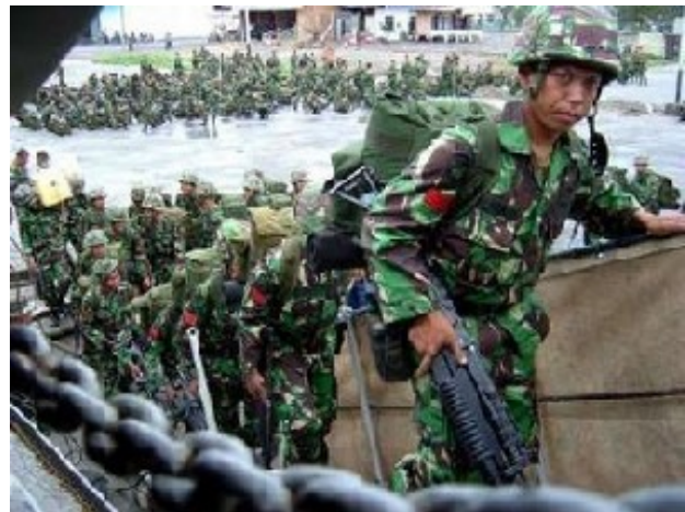
Indonesian soldiers board navy ship

well as important sea-lanes, including parts of the Malacca Straits. Indonesian waters are also rich in gas and oil, and exploitation of these resources is taking place in different parts of the country. Given the size and importance of Indonesian waters and the many controversies surrounding the working practices of the Indonesian military (TNI) and police, they will receive particular attention here.