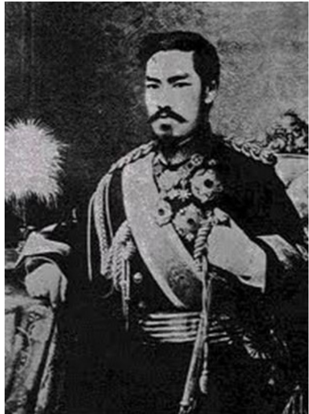
The Meiji Emperor

The ideology focused on the emperor as descended from the founding deities, as national father figure, and as the focus of the citizens' loyalty. He became the symbol of Japanese nationalism.