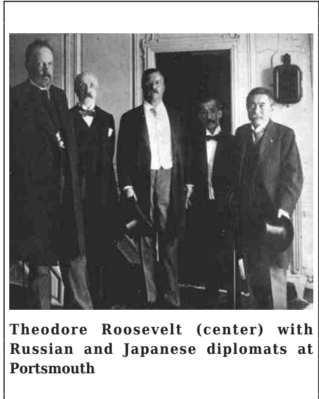
Theodore Roosevelt (center) with Russian and Japanese diplomats at Portsmouth

annexation of Korea (this was only seven years after the US had taken the Philippines from Spain and Hawaii from its ruling family, and three years after the United States military had brutally suppressed a Filipino independence movement.)