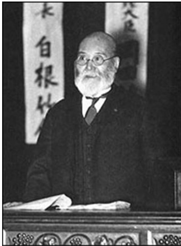
Takahashi Korekiyo. Photo taken during the 1936 election campaign, approximately one week before his assassination

from the Germans during World War I, limited American, British and Japanese bases in the Pacific, and required all signatories to “respect the territorial integrity of China,” a euphemistic expression which meant no further aggressive military intervention in China. Takahashi, with the support of most of his party and all of the opposition party, thus bought into a policy of cooperation with the United States and Great Britain over China. (Takahashi was not anti-imperialist, but realistically opposed Japanese empire building outside the Anglo-American framework.) Not all Japan’s leaders, and particularly not most of the army’s and navy’s leadership, agreed with this policy—that is, they still advocated a strong military and autonomy. But given the antiwar public mood of the 1920s, they acquiesced for the time.