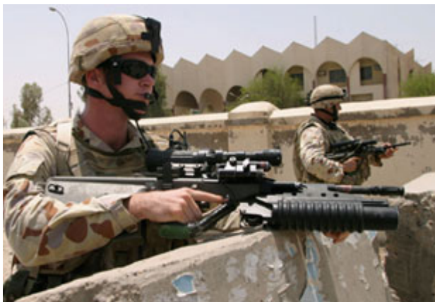
Australia has approximately 1,500 troops in and around Iraq

In trying to convince a doubtful public that there is a reason for Australian troops to be involved in two Middle Eastern wars at one time, the Update authors were clearly labouring under several difficulties.