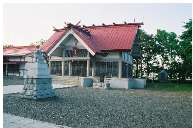
Fig. 13: The memorial to civilian victims of the Kushiro air raids, 14-15 July 1945, and site for Kushiro's official municipal commemorations. Sakaemachi Peace Park, Kushiro.