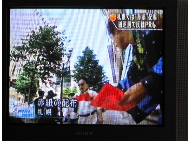
Fig. 15: Members of a citizens group hand out draft papers in Sapporo on 15 August 2005.

meanwhile, said “forcefully” that he never wants to go to war. This thirteen-year-old boy’s comments are indicative of the fact that, whatever the virtues or failings of the Japanese education system regarding the teaching of war history, many children know how to use the pervasive “war is bad” rhetoric from an early age.