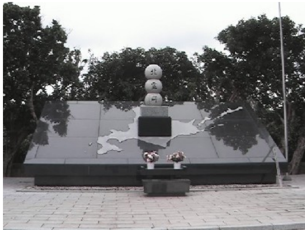
Fig. 2: Hokureihi—The monument to over 33,000 soldiers from Hokkaido who died in Okinawa and Southeast Asia. It is in a park in Itoman City, Okinawa, that contains other prefectural memorials a few kilometers from the Himeyuri memorial. It is maintained by the Hokkaido Rengo Izokukai.