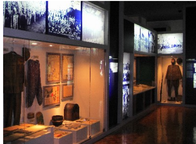
Figs. 8 and 9: "From Recession to World War II" exhibits in the Historical Museum of Hokkaido

The second important form of extra-curricular war education for Japanese children is listening to the testimony of a member of the war generation. As in most "peace education," the moral is "the terrible nature of war" and not a jingoistic defense of Japanese actions. The archetypal testimony at schools that is reported in the Japanese media is civilian testimony of air raids. For example, the Hokkaido Shinbun reported on 14 July 2006 that in Kushiro (one of the cities affected most by the Hokkaido air raids of 14-15 July 1945), survivors of the air raids had been speaking to children at elementary and junior high schools. [37]. But testimony of other military and civilian experiences can feature, too, provided that it fits within the school's definition of "peace education." In the same university student survey mentioned above, 11.2 per cent of the 436 students said that they had heard testimony from a member of the war generation invited to speak at their junior high school, while 18.6 per cent had heard such testimony at senior high school.