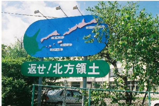
Fig. 6: A sign saying "Return the Northern Territories" outside a public building in Nemuro

Also central to the development of collective memory is the transition from the war generation's memories of personal experience to the second-hand memories of the postwar generations. The importance of family, friends and furusato within collective memory can be seen in the standard processes by which the postwar generations today acquire historical consciousness. Awareness of war history among Japanese youth today often starts "closest to home" with a grandparent's story from the war years ("When I was your age ..."). As part of a general survey into historical consciousness that I carried out among university students in Hokkaido in 2004 and 2005, 436 respondents (51 per cent male, 49 per cent female, 236 of whom were from Hokkaido) were asked if they had heard the war experiences of a relative (see Fig. 7 below). Of these 436 students, 197 (45.2 percent) reported hearing the war experiences of a relative directly from that relative, 42 (9.6 per cent) had heard of a relative's experiences indirectly, 12 (2.8 per cent) had heard both directly and indirectly; 152 (34.9 per cent) had not heard the war