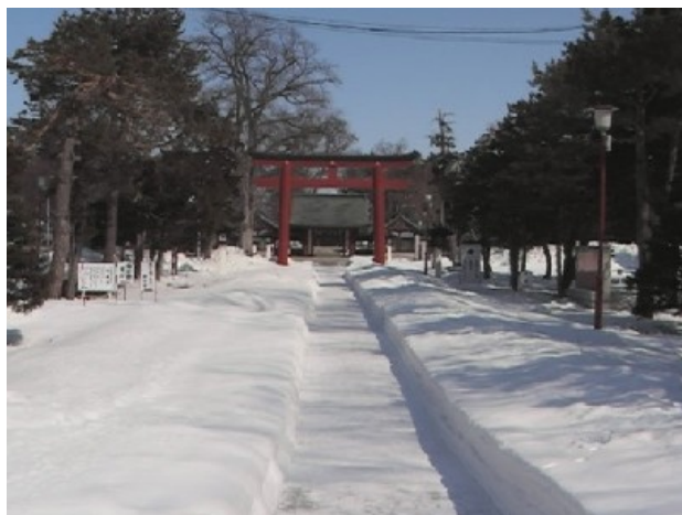
Figs. 3 and 4: Hokkaido Gokoku Jinja (Nation Protecting Shrine) in Asahikawa