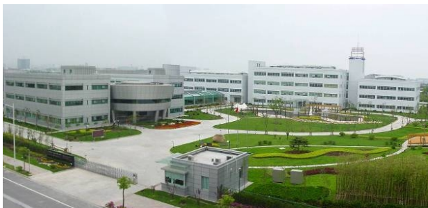
The Shanghai Center for Bioinformation Technology: "a corporate center with strong academic ties"