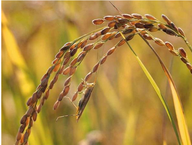
Rice is the first grass species to be sequenced

Currently, the amount of genetic information decoded in China accounts for less than 2 percent of all such worldwide activity. But participants at international conferences have already started talking about China's potential.