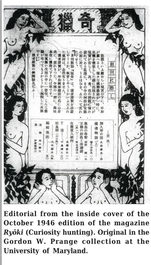
Editorial from the inside cover of the October 1946 edition of the magazine Ryōki (Curiosity hunting). Original in the Gordon W. Prange collection at the University of Maryland.

As we saw in the previous chapter, the Japanese term ryōki , or “curiosity hunting,” refers to a well-established prewar genre of writing obsessed with strange and bizarre events that was part of the 1920s preoccupation with “erotic, grotesque nonsense.” That a magazine with the title Ryōki was the first postwar publication to be prosecuted by the Japanese police might suggest that they identified the entire ryōki genre, with its interest in, among other things, “sexual perversion,” as injurious to public morals. Indeed, unlike some magazines that sought to disguise their prurient interests under a scientific or educational guise, the editors of Ryōki had always been unapologetic about the content of the magazine. They declared on the first issue’s contents page that Ryōki had “no intention whatsoever to educate or enlighten” its readers (see fig. 1).