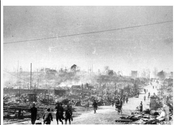
Tokyo in ruins, April 14, 1945. Ishikawa Koyo

When the advance guard of the Occupation forces arrived in Japan in early September 1945, Tokyo lay in ruins. It is almost impossible to imagine the scenes of destruction that greeted the arrival of the American soldiers. It was not just the scale of physical destruction, especially in major cities such as Tokyo, Yokohama, and Kawasaki that was confronting, but the almost unimaginable scale of human desolation and misery. In Tokyo hundreds of thousands of people were starving, camped out among the ruins of burnt-out neighborhoods. In many areas there was no running water, no electricity, no shops, no transport, no food, no shelter. There was, of course, no waste disposal, and the destroyed cities stank like a sewer.