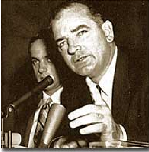
Joseph McCarthy and Chief Counsel Roy Cohn

This graphic example of U.S.-style “democracy” in action has had a lasting legacy in Japan, albeit a somewhat ironic one. It fractured an already highly factionalized Left. It strengthened the foundations of what would turn out to be an enduring “one-and-one-half-party” democracy, dominated by slavishly pro-American conservatives. And it made a mockery of rule of law (just as U.S.-endorsed remilitarization under the clearly anti-military Constitution would continue to do to the present day).