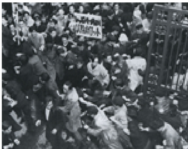
Tokyo University students mobilize to oppose the purge

From the start of 1950, the Red Purge by private corporations moved forward apace with the backing of GHQ. MacArthur's letter of July 18 to Prime Minister Yoshida Shigeru led the way. The letter directly orders suspended publication of the central organ of the Japanese Communist Party, Akahata (Red Flag), along with publication of any successor newspaper. This letter became the sole legal basis for the red purge in the media. The GHQ authorities insisted that the letter took precedence over all other laws and that its instructions constituted a 'directive' (shiji) rather than an 'order' (shirei).