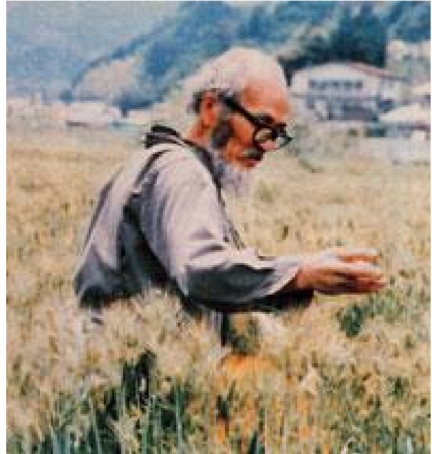
Fukuoka in the field

to the point where my natural farm could yield, without any effort, virtually as much rice and wheat as typical scientific farms."