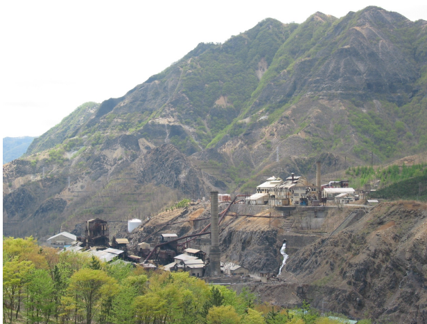
FIG. 3: Remains of the Ashio Refinery, 2002.

At Ashio itself, every year hundreds of volunteers from Ashio Green Growing Association ( Ashio ni Midori o Sodateiru Kai ) assemble near the remains of the Ashio refinery in an attempt to replant the mountainsides. This process is slow and requires much experimentation as the soil still contains large amounts of sulfur left by one hundred years of toxic smoke from Ashio’s stacks.