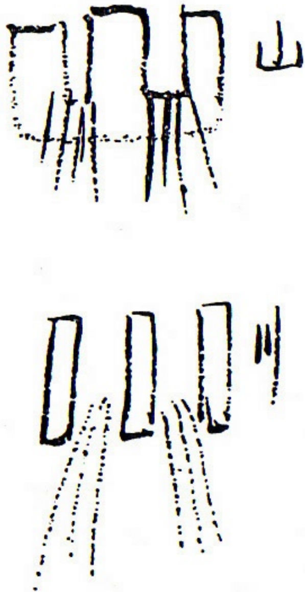
FIG. 2: A Tanaka diary entry from 26 Jan 1912.

To prevent doku and to foster life, humans needed to learn how to organize themselves in a way that lets them take advantage of the benefits of a freely flowing ecosystem. A diary entry from 26 January 1912 shows Tanaka playing with the Japanese characters for mountain ( yama ) and river ( kawa ) to illustrate the complementary relationship of the land and water in fostering flow. Tanaka's own caption read: "These diagrams express the principle of nature. River managers who understand the meaning of these pictures are rare indeed."