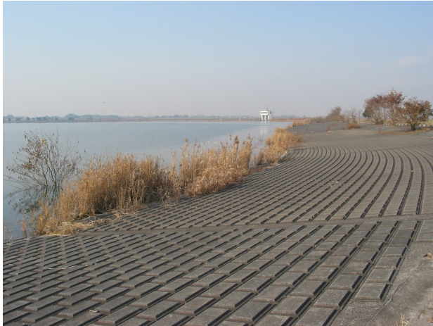
FIG. 6: Concrete bank of the Yanaka Reservoir, 2002.