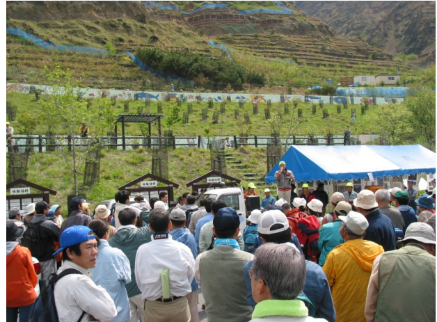
FIG. 4: Meeting of the Ashio Green Growing Association, 2002.