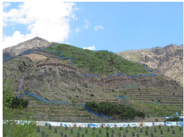
FIG. 5: Experimental reforestation at Ashio: The green zone at the top is a mix of soil, seed and fertilizer sprayed onto the rock in an attempt to compensate for the lack of topsoil.

In a great historical irony, the Yanaka reservoir has become a place of “nature recreation” and its brochure features a cartoon windsurfer enjoying the open water. Yet even while the banks of the reservoir today appear natural, their earthen facades are built on a base of hard-engineering and concrete.