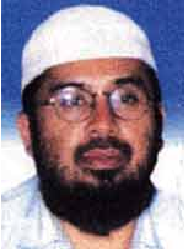
Head of Jamaah Islamiyah

After the overthrow of the Soekarno regime, the fortunes of Darul Islam turned. Virulently opposed to ‘the godless’ Communists, DI veterans played a strong role in the fight against communism, from the mid-1960s through the 1980s. All Islamic organisations, including DI, enthusiastically backed the CIA-orchestrated coup (from 1965 to 1966) that installed the Soeharto dictatorship and resulted in the massacre of an estimated 500,000 Communist Party members, workers, and sympathisers. When the Soviet Union invaded Afghanistan in 1980, Darul Islam sent 360 [4] members to help the Afghan mujahideen . [5] Among jihadists who came to Afghan in that period was Osama bin Laden and thousands of other jihadists worldwide. In Pakistan and Afghanistan DI members came into contact with Sheikh Abdullah Yussuf Azzam [6], who was the key to establishing what the International Legion of Islam is today (Bodansky, 1999: 10). Bin Laden’s role was to transmit Saudi money – not just his own. By the late 1980s, there were branches and recruitment