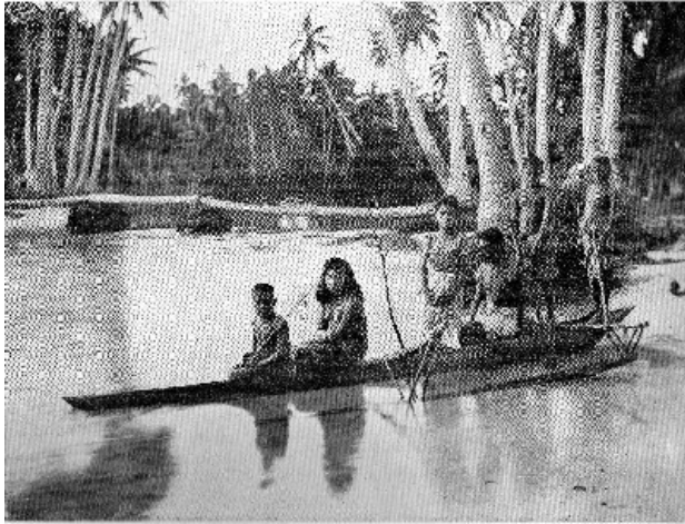
"Natives and canoe, Savai'i", under "Samoa" in The World of Today , Volume 4, 1907, p. 187.