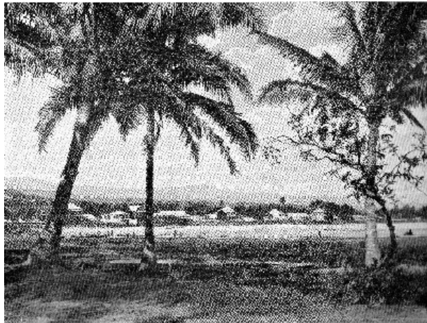
“Apia, Samoa”; the second illustration under Samoa in World of Today , Vol 4, 1907, p. 183.

narratives, it seems editors and readers were comfortable with this manner of knowing Samoa.