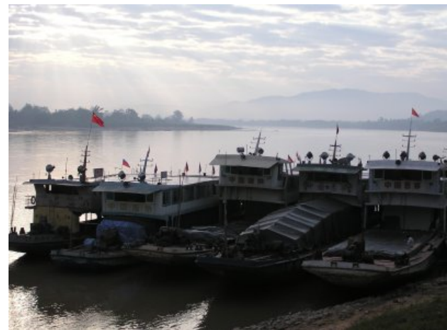
Chinese cargo ships ply the Mekong

Environmental groups first raised the alarm in