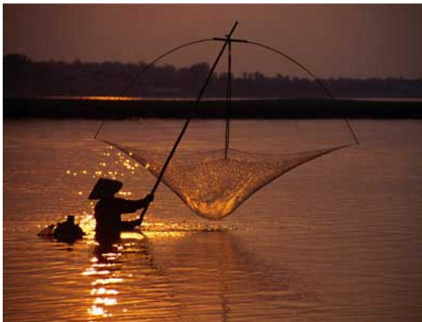
Fishing the Mekong