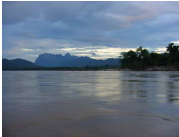
The Mekong River

BANGKOK - Energy-hungry China has started to use the Mekong River as a new oil-shipping route, raising new environmental concerns that accidental spills could adversely affect the livelihoods of nearly 60 million downstream river dwellers and eventually evolve into a bone of diplomatic contention between Southeast Asian countries and China.