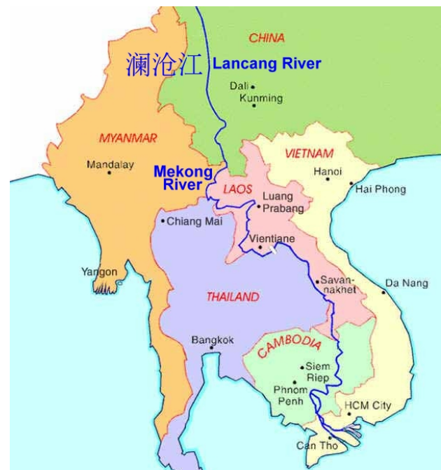
Map of the Mekong

About 75% of China's fuel supplies currently flow through the narrow, pirate-infested Strait of Malacca, positioned between peninsular Malaysia and the Indonesian island of Sumatra. On the strategic front, Beijing has repeatedly expressed its concerns that in a potential conflict US naval vessels could move to choke off Chinese fuel shipments through the waterway.