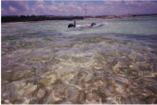
The dugong habitat with Camp Schwab in the background

The Japanese government appears committed to the construction of the base at Henoko and prepared to deal with any criticism while international interest in the environment of Henoko has risen.