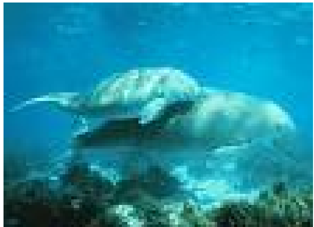
The dugong at sea

progress. In September 2003, US based environmental groups including the Center for Biological Diversity and their Japanese counterparts including Higashionna Takuma from Nago city, represented by Earthjustice, filed a lawsuit against the US Department of Defense (DoD) in the US Federal District Court in San Francisco. They sought to require the US Department of Defense to comply with the National Historic Preservation Act (NHPA) by conducting an assessment of the impact of the proposed base construction on the Okinawan dugong and other endangered species. [17] The Okinawa dugong is listed as a “Natural Monument” under Japan’s “Cultural Properties Protection Law”. It is also listed under the US Endangered Species Act. In the initial court hearing, the US DoD asked for the case to be dismissed, arguing that the issue was one for the Japanese government only. [18] The judge ruled, however, that the case should be heard, and it is currently proceeding. [19]