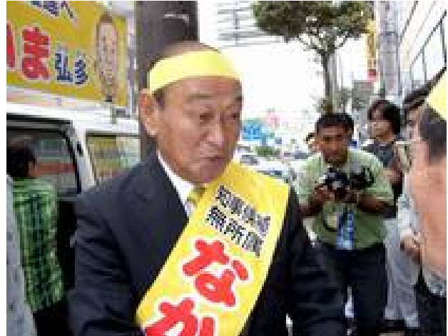
Nakaima Hirokazu on the campaign trail

For the next four years, many expect Okinawa's new governor, Nakaima, the former chairman of the Okinawa Electric Power Company, to follow many Japanese government's policies, notably the controversial plan to replace the US Marine Air Station at Futenma with a new US base at Henoko, Nago city, in the north of the island, in waters still relatively unspoiled which also constitute crucial habitat for the endangered dugong species.