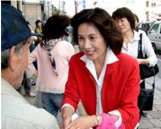
Candidate Itokazu Keiko

Itokazu’s campaign was also seen by many as notable for anti-base rhetoric but weak on economic issues. While her anti-construction stance was well received by her supporters, she was unable to articulate and deliver an economic program to the wider public. Her pledge to transform the important but ailing construction industry into a sector that would shift its focus from wasteful and environmentally damaging public work projects to works that would help revive Okinawa’s degraded environment was not clearly explained. Struggling to survive as they are at present, many construction firms and their large labor force were not ready for such drastic changes. [3]