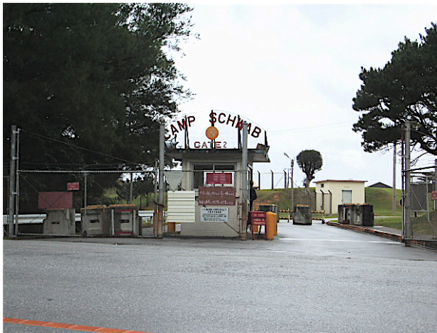
Entrance to Camp Schwab

was created by the US government and military and the Japanese government in 2001 as the “sole source of guidance for environmental compliance, requirements, regulations, and standards for DoD activities and installations in Japan.” [24] The JEGS recognizes the dugong as an endangered species. The coalition is also examining the implications of Final Report: Task 5 Cultural Historical, and Archeological Documentation, MCB Camp Smedley D. Butler and MCAS Futenma, Okinawa (1993) published by the US military. [25] The report documented the results of examination of documents and surveys on archeological, cultural and historical resources of Okinawa in relation to US bases on the island of Okinawa. It recognized the existence of cultural assets with scientific value in Camp Schwab, where the construction of the new base is planned.