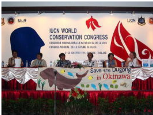
IUCN World Conservation Conference

Japanese government's EIA. The representative of the US Department of the State refused to accept the draft, arguing that the US government could not intervene in the matters of a "sovereign state." The final and compromised version of the recommendations urged the US government to "cooperate, if requested, in the environmental impact assessments carried out by the Government of Japan for military base site construction." [20] To date, however, there has been no sign that the Japanese government has asked the US government and military to do so.