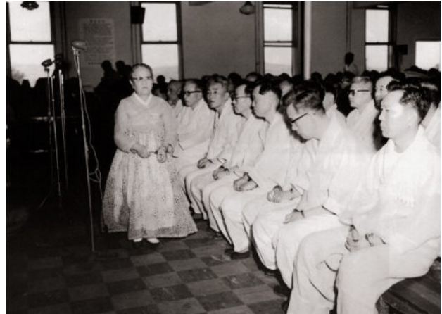
Senior officials of the Minjok Ilbo in court, 1961

Other cases are expected to be opened shortly, including that of the 1961 execution of Cho Yong-su, President of the Minjok Ilbo newspaper, for violating the National Security Law.