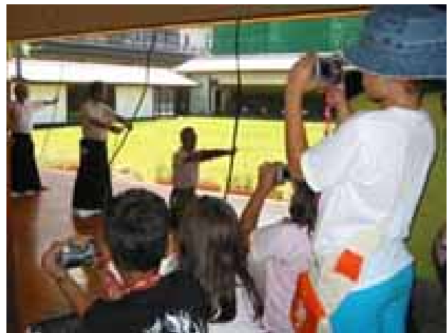
Nikkei Brazilian children

They are clustered in towns like Oizumi, Gunma Prefecture, and Toyota City, Shizuoka Prefecture, where automotive and other manufacturers have plants and suppliers. In the national policy void, cities have taken the lead in accommodating immigrant communities. Several have convened political advisory boards of immigrants, or even extended non-citizens the right to vote on local issues. Kawasaki City, among the most pro-active, adopted a policy in which the city serves as a housing guarantor, key to helping foreigners rent apartments.