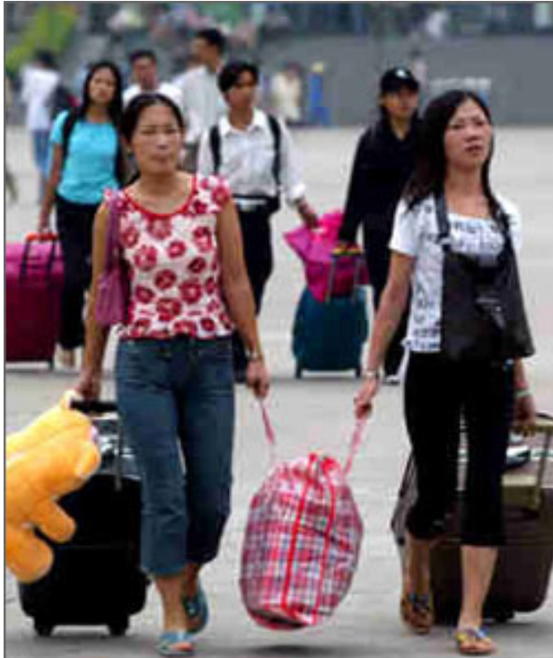
Immigrants arriving in Japan

vast majority of these are the so-called old-comers whose families have lived in Japan for two or three generations, and who culturally and socially are nearly identical to Japanese. Koreans, however, have become a shrinking minority, as they are naturalizing more rapidly than before and thus disappearing from census records that note nationality but not ethnicity.