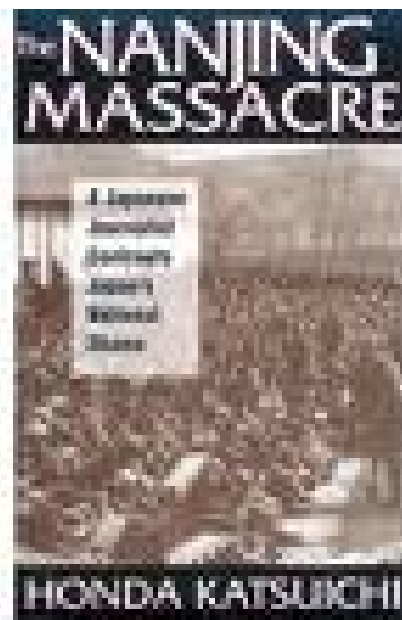
The Nanking Massacre

result of the Tokyo trials immediately after the war, [20] with the passage of time they had faded from memory. Now, however, provoked by reports of the brutal behavior of American soldiers in Vietnam and a sense of guilt for Japan’s cooperation in the war, the historical precedents for victimization of “Asia” were again recalled. This time it was Japanese journalists and researchers, not American victors, who documented Japanese war crimes and atrocities in China and throughout Asia. Also prompted by the Vietnam War were some late-1960s novels that dealt with war memories, including Ooka Shohei’s Leite Senki (Leyte War Diary) and Ibuse Masuji’s Kuroi Ame (Black Rain).