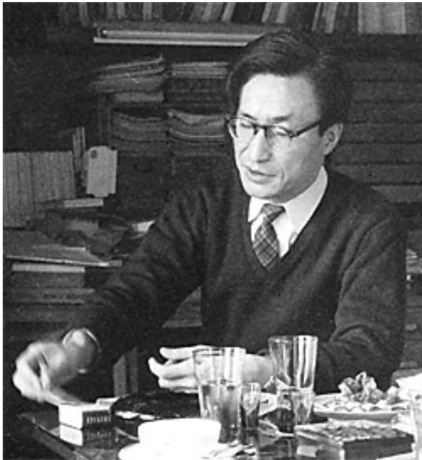
Maruyama Masao, 1959

mentality, as well, beginning with intense rivalry among, and nepotism within, the Army, Navy, and civilian bureaucracy. These realities of wartime society were a far cry from the ideal types of modern rationalism that were envisioned by intellectuals. Moreover, owing to the democratization policies of American occupation forces under the command of General Douglas MacArthur, the supposedly “overcome” ideal of liberal democracy experienced a revival.