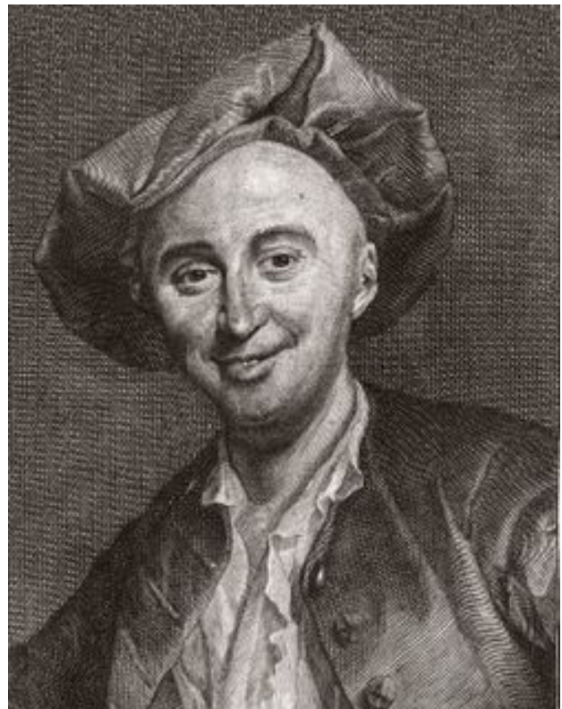
Julien Offray de La Mettrie