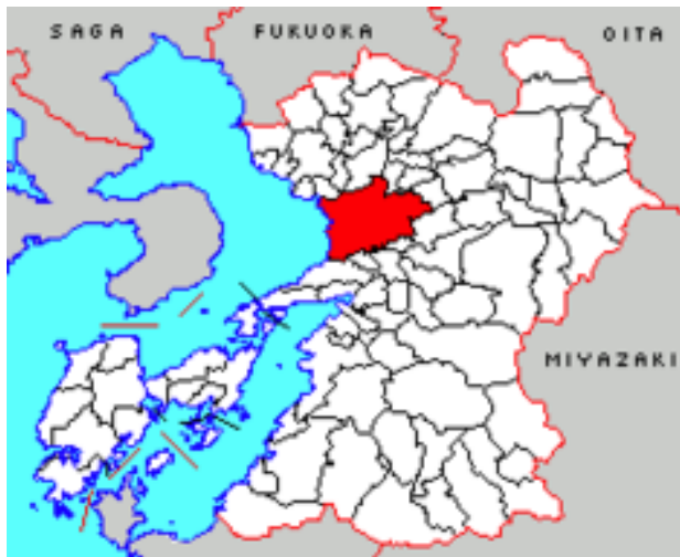
Kumamoto in red

war. By the end of the war, almost all the city from the station to the Suizen Temple had been reduced to a burnt-out wilderness. Reconstruction did not get underway properly until around the time of the Korean War, and even when I was born the dark scars of war still lay over the landscape.