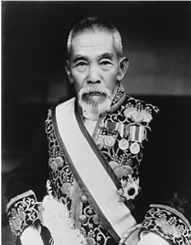
Inukai Tsuyoshi, Ogata's maternal grandfather served as Prime Minister

of human rights that recommended her to Boutros-Ghali's office in New York.