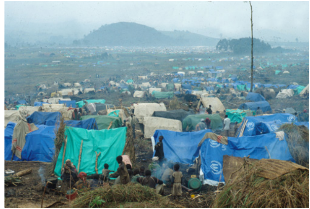
Refugee camp in Zaire

the Convention with apparent impunity. The UN itself has estimated that, during 1996–97, two hundred thousand Rwandan refugees were killed in Zaire. [16]