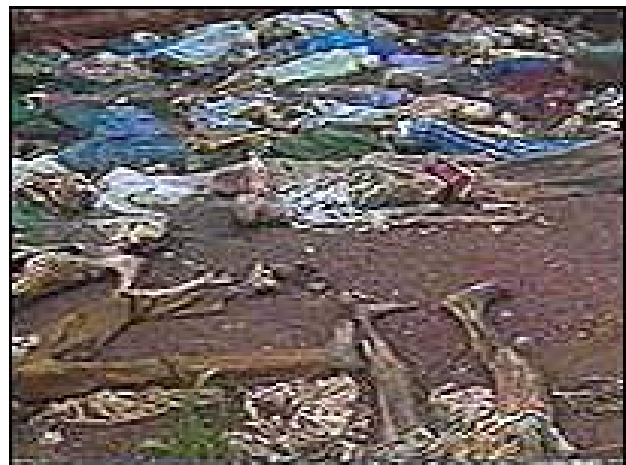
Victims of Rwandan massacre

of up to 800,000 predominantly Tutsi civilians in Rwanda. One million mainly Hutu refugees moved into what was then Zaire in 1994, and UNHCR immediately appealed for military help. French troops were there from the start, shortly followed by US Army logistical support—Operation Support Hope—then Swedish and German troops, and the Japanese Self-Defence Force (a minor breakthrough in Japan's remilitarization, which Ogata celebrates). Setting up and running the camps required the support of Mobutu's regime, which he gave with a view to strengthening his hand in the region and in international negotiations. [7] Ogata argued that 'From the outset it seemed obvious that return was the main solution. The refugee outflow was too massive for the people to be absorbed by neighbouring countries or to be resettled in third countries.' [8] This policy was now becoming so entrenched that it no longer seemed necessary for UNHCR even to ask whether repatriation was in the best interests of the refugees. Sporadic massacres of displaced civilians within Rwanda seem only to have slightly delayed the apparently inevitable return.