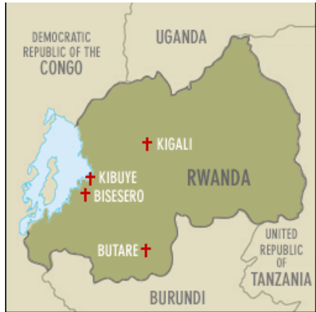
The landscape in Rwanda is littered with massacre sites

By November 1996, Rwandan forces and the Banyamulenge had joined with Congolese rebel groups to form the Alliance of Democratic Forces for the Liberation of Congo (ADFL). Aiming ultimately to topple Mobutu's regime, and so viewing the refugee camps as a local threat, the ADFL attacked more of the camps. Half a million refugees were forced to converge in one small volcanic area in Goma, with no more than a few hundred UNHCR staff trying to arrange sanitation, food and water. At the worst point, three thousand people were dying every day. [10] Pressure mounted on the UN to act, and Canada offered to lead a multinational force. Rwanda and the Congolese rebel forces moved quickly, with likely US connivance, to make sure that an international military presence would not impede their war aims. Rwandan Vice-President Kagame ordered attacks on camps in Mugunga with rockets, mortar and heavy artillery, forcing half a million refugees in the direction of Rwanda. The UNSC resolution ordering a deployment was passed the next day, but Kagame had ensured that it would not take effect: the camps it was to protect had been dispersed. He also