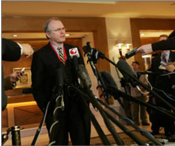
Assistant Secretary of State for East Asian and Pacific Affairs Christopher Hill speaks to journalists at a hotel in Beijing, Feb. 2007.

In February 2007, as the resumption of the 6-party process shows, US policy changed from mostly sticks to more carrots. Why? Is it that North Korea had become more dangerous by acquiring nuclear potential? Although nobody can be sure whether the nuclear device is functional, there is a suspicion that it might be almost worthless from a military point of view. For one thing, it is doubtful that North Koreans have the technology to enable them to make a combat-ready nuclear weapon, although nasty surprises are not impossible. For another, they do not have - and will not have in the immediate future - any means of delivery. But North Koreans actually do not need a nuclear bomb to deter an all-out conflict - their conventional forces and subversive capacities are enough to contain any such attempt - and the Pentagon agreed a decade ago it was not worth it. Nor was there any obvious sense of increased threat on the part of its adversaries after Pyongyang went nuclear.