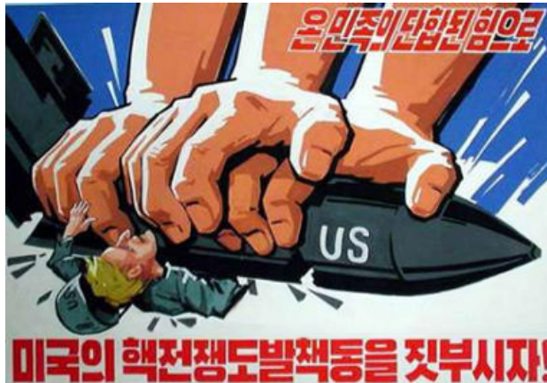
North Korean poster: "With the people's united power, let's crush U.S. maneuvers to provoke nuclear war."

Will a new proportion of "more carrots, less sticks" help? In North Korea's case, sticks have had, and almost certainly will have, little or no effect. The reason is the peculiarity of its "besieged fortress" mentality on which the regime's legitimacy is based, and the regime's emphasis on WMD as the ultimate guarantor of its existence. It took several years for policy-makers to come to terms with that reality.