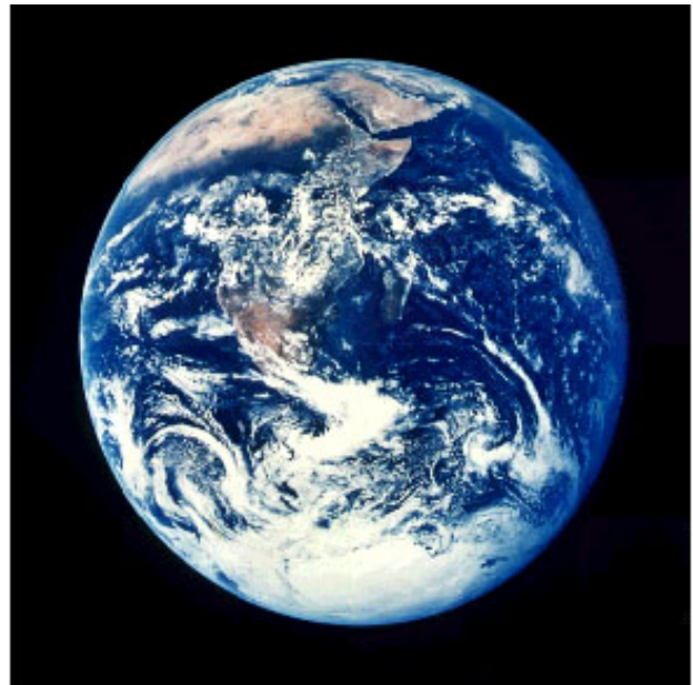
Spaceship Earth as seen from Apollo 10

Human history has recorded numerous examples in which civilizations collapsed because of overexploitation of the environment (Ponting, 1993; Diamond, 2005). Such experiences were more or less local. However, what we are now facing is a possible collapse of the spaceship Earth itself, or rather the human civilization on it. This spaceship is closed in terms of material; i.e., no significant amount of material comes in and out. The only significant input is solar energy, the only truly renewable resource available to all living creatures on the Earth.