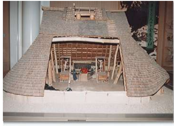
A model of a takadono, a high-roofed structure with a furnace and foot bellows (tatara), on display at Wako Museum in Shimane Prefecture.

and "kotatsu" (a foot warming device) which heat only locally those sitting nearby. People wore more clothes when cold. The other device, called "irori" (hearth) was a kind of fireplace, but it was used mainly in farmhouses. These devices may not have been as comfortable as contemporary space heating, but were very frugal in terms of energy use.