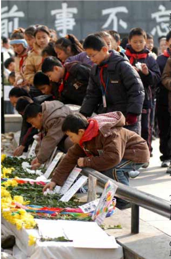
Chinese students place flowers in front of a monument for victims during a gathering marking the 68th anniversary of the Nanjing