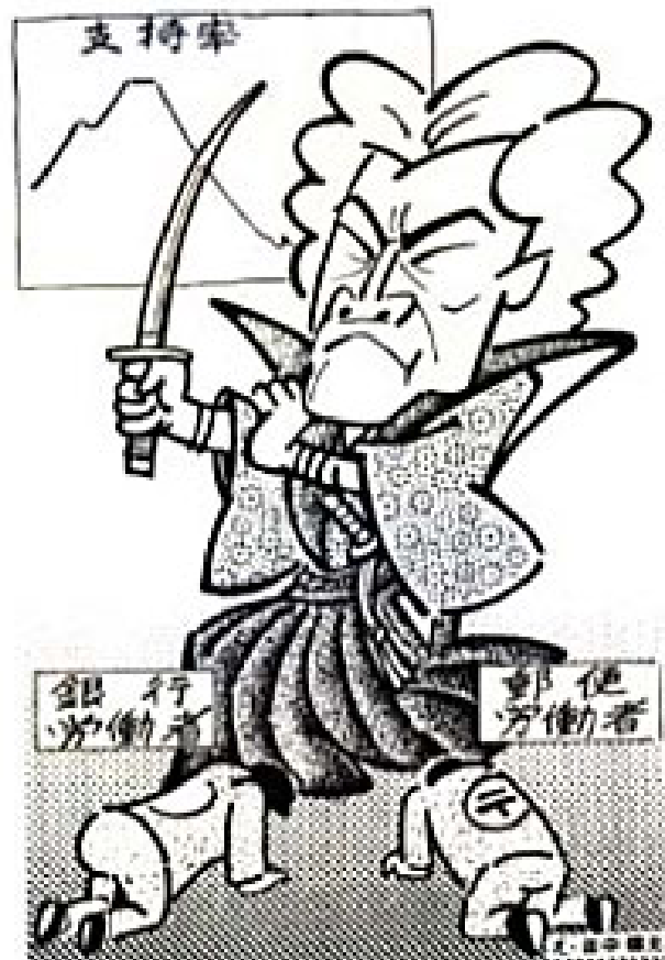
Koizumi and postal reform

tenure, especially in his last year in power. Yet he never suffered anything like Abe's crash. That's because Koizumi never lost control of the political process and appealed directly to voters with a clear and persuasive message about the need for reform. Koizumi famously declared that he was out to "destroy the LDP" and the traditional system of vested interests, which he assured voters would give a huge boost to Japan's efficiency and competitiveness. He cast the 2005 parliamentary election, for example, as a referendum on his campaign to privatize Japan's immense, state-run postal service (which includes the country's largest bank) in order to introduce market forces and break the power of corrupt officials. The public bought it, and Koizumi's team won a landslide, even winning over large numbers of unaffiliated voters.