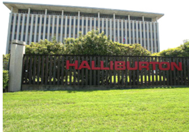
Halliburton Corporation's Houston offices

& Root), a subsidiary of the Halliburton Corporation of Houston.