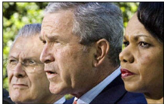
Former US Secretary of Defense Donald Rumsfeld, US President George W. Bush, US Secretary of State Condoleezza Rice

reality, many of the changes seemed to be determined largely by the Bush administration's urge to punish nations and domestic states that had not supported its efforts in Iraq and to reward those that had. Thus, within the United States, bases were being relocated to the South, to states with cultures, as the Christian Science Monitor put it, "more tied to martial traditions" than the Northeast, the northern Middle West, or the Pacific Coast. According to a North Carolina businessman gloating over his new customers, "The military is going where it is wanted and valued most."