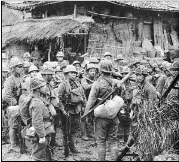
Kwantung Army soldiers in the field

and engage in campaigns to invade northern China and Inner Mongolia. The notorious 731 Unit, which conducted human experiments to develop chemical weapons, was a unit of the Kwantung Army.