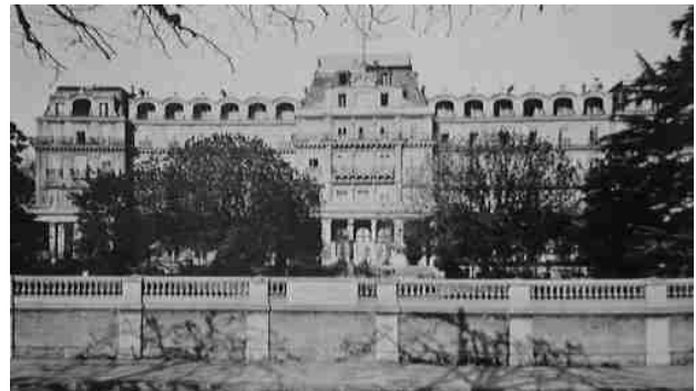
League of Nations Headquarters, Geneva

"Did Lytton really receive 'Truth'?" I inquired at the library. Two days later, the library responded to the effect that the booklet had been located among League-related materials.