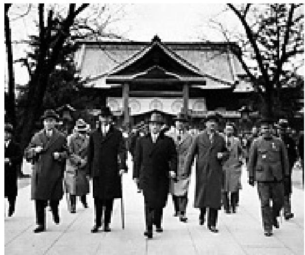
March 1932, Lytton Commission at Yasukuni Shrine. Lytton is second left

Commission to China in the first place? At the time of the Manchurian Incident, the top priority of Chiang Kai-shek's nationalist government, whose capital was Nanking (now called Nanjing), was to eliminate the Communist Party as the "arch enemy" at home, rather than stand up to the invading Japanese army. Chiang immediately appealed to the League of Nations to deal with the Japanese invasion, thereby putting the problem in the international arena.