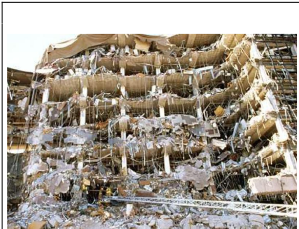
Oklahoma City Bombing

Recently I viewed for a film, "A Noble Lie," about the 1995 Oklahoma City bombing. 16 This gave me a chance, for the first time, to test these hypotheses against the case of Oklahoma City on April 19, 1995, or what I shall call 4/19. More than I could have anticipated, 4/19 fit into and strengthened this analysis.