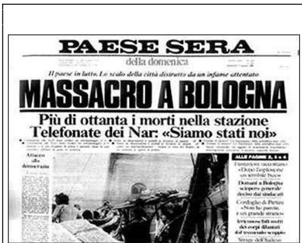
Strategy of Tension

Gladio connections to sustained false-flag violence, again involving NATO and the CIA, were subsequently established in other countries, notably Belgium and Turkey. 12 I wish to propose that America, as well as Europe, has also suffered from a similar series of false-flag structural deep events, including bombings, that have, in conformity with the same strategy of tension, systematically moved America into its current condition, a state of emergency.