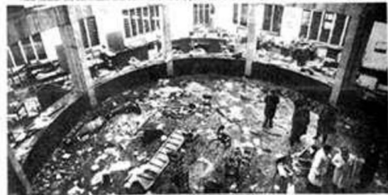
Piazza Fontana bombing