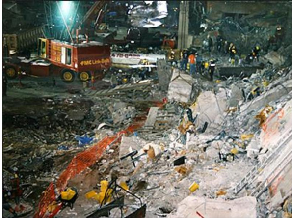
First World Trade Center bombing of 1993