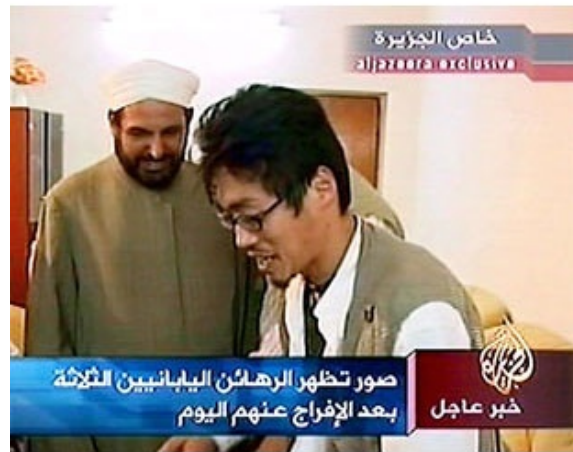
Koriyama at time of release