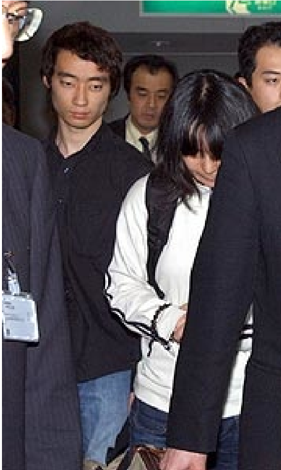
Return to Japan