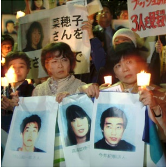
Supporters gathered in Tokyo