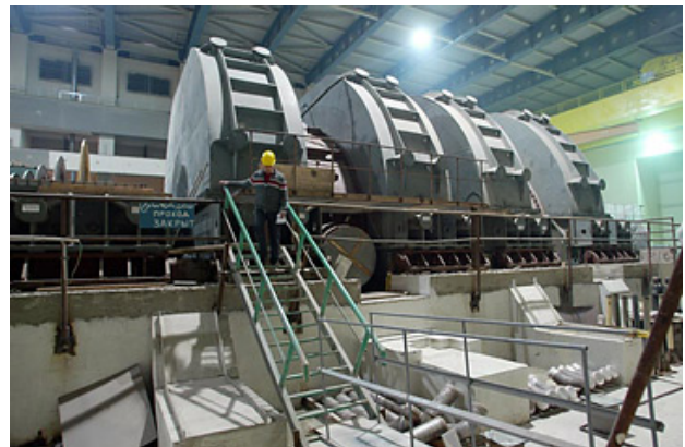
The Bushehr nuclear power plant