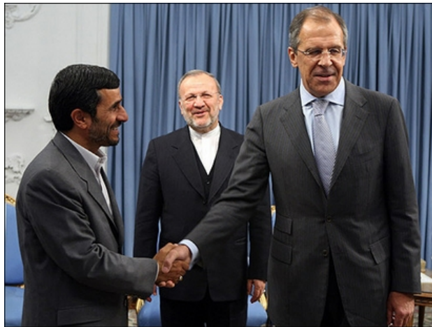
Iranian Prime Minister Mahmoud Ahmadinejad (left) shakes hands with Sergei Lavrov as Manouchehr Mottaki looks on

Foreign ministers are busy people - especially energetic, creative diplomats like Russia's Sergei Lavrov and Iran's Manouchehr Mottaki, representing capitals that by tradition place great store on international diplomacy.