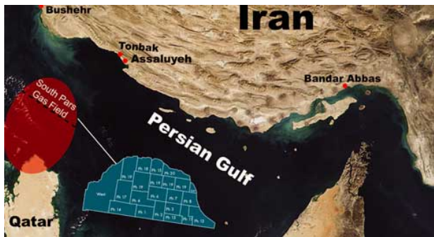
The South Pars Field

Russia's number one priority in energy cooperation with Iran will be for upstream participation by Russian companies. Gazprom has had some limited participation so far in the early phases of Iran's massive South Pars gas fields with an estimated aggregate cumulative production range of a stunning 13 trillion cubic meters. Moscow will be keen to promote greater involvement. Gazprom has shown interest in the Iran-Pakistan-India pipeline project not only as a contractor but also as an investor.