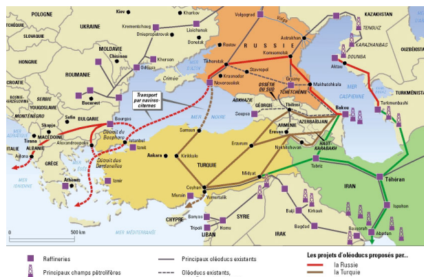
Caspian oil and gas pipelines and projected lines

agreement relating to the Caspian littoral pipeline on December 12 with his Kazakh and Turkmen counterparts, the curtain came down on one of the grimmest struggles of the great game in the post-Soviet era. Moscow came out the winner by far, reasserting its pre-eminent position in the Caspian.